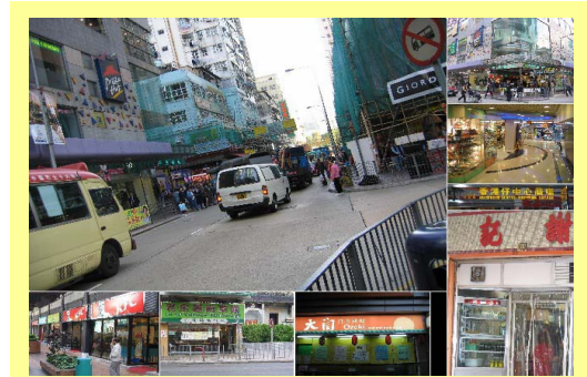
Shops in Aberdeen

In Aberdeen there are shops and shopping malls selling fashionable products alongside everyday items. Also, there is a wide variety of restaurants offering food from nearly all over the world.