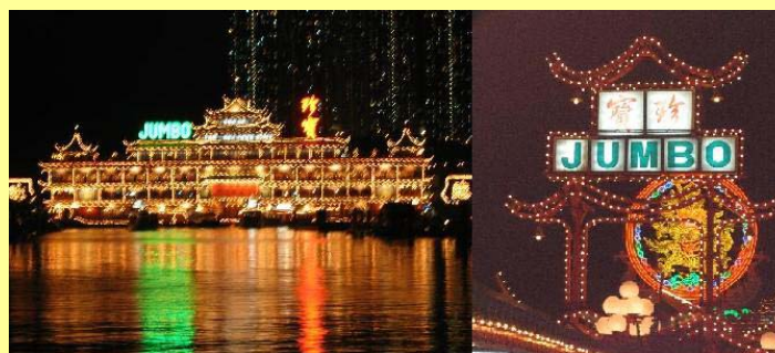
Jumbo Floating restaurant

When the boat is travelling around the harbour, you will see a large Chinese palace floating on the sea. It is the world famous Jumbo floating restaurant. On this floating palace you can appreciate the Chinese decorations, enjoy the different varieties of delicious seafood and