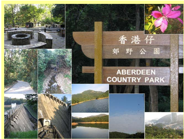
Aberdeen Country Park

Aberdeen Country Park is situated at the hillside, far away from the town and traffic. It's hard to believe such a forest with various plants, insects and animals can be found just behind the crowded and modern city. Come and have a look by walking along the hiking trails here, appreciate the beautiful biodiversity of Hong Kong.