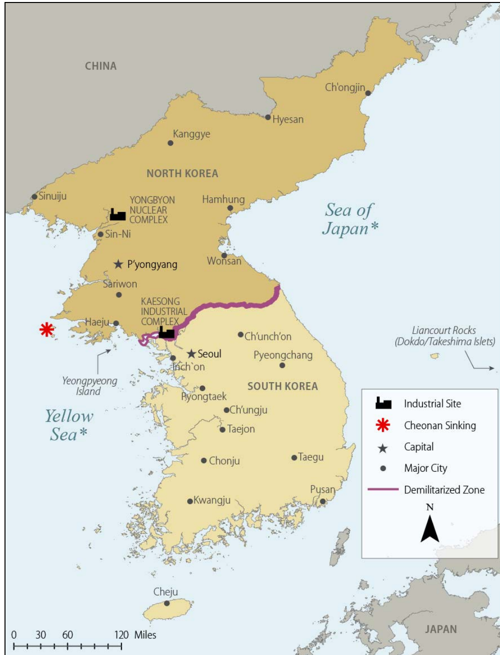
Figure 2. Map of the Korean Peninsula