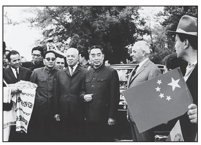
Zhou Enlai with Ion Gheorghe Maurer, on a visit to Romania in June 1966

This is why we think that this is the moment to find a solution to end the conflict in Vietnam as quickly as possible. It is clear that this solution, to a certain extent, represents an advantage for America. The fact that America ends the war in Vietnam is a good thing for it. The question is, how will it bring it to an end? If it finishes it ensuring that the Vietnamese people will be able to decide their own fate, then this solution is, in our opinion, more advantageous to the Vietnamese and all of us, than to the Americans. We also think that this solution might be reached during the discussions. What is important, though, is to conduct these discussions with enough skill and to take into consideration the fact that what probably constitutes for them—so to speak—the major holdback is [the need] to save the prestige of the United States, so that the United States won't come out of this completely humiliated. If a solution that will ensure this is found, it is our opinion and convic-