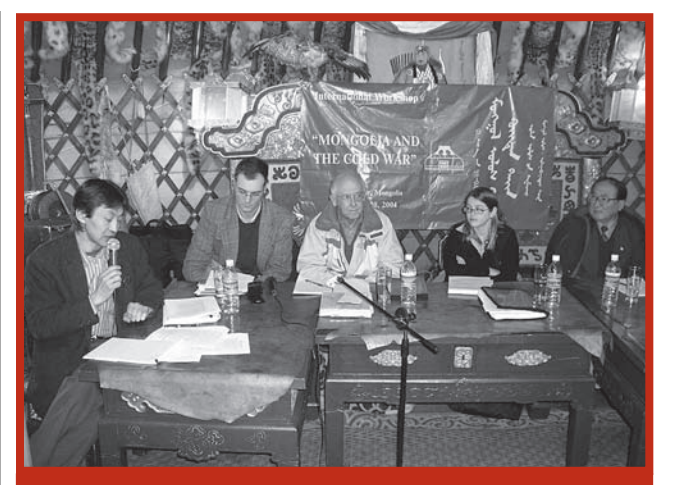
Mongolia and the Cold War: International Workshop, Ulaanbaatar, Mongolia, March 2004:

After the 20th Congress of the CPSU [Communist Party of