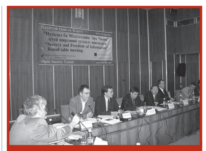
Secrecy and Freedom of Information Roundtable Ulaanbaatar, Mongolia, March 2004:

In particular: the fact that the American imperialists are increasingly using the "security treaty" concluded between the USA and Japan [on 19 January 1960] in order to turn Japanese