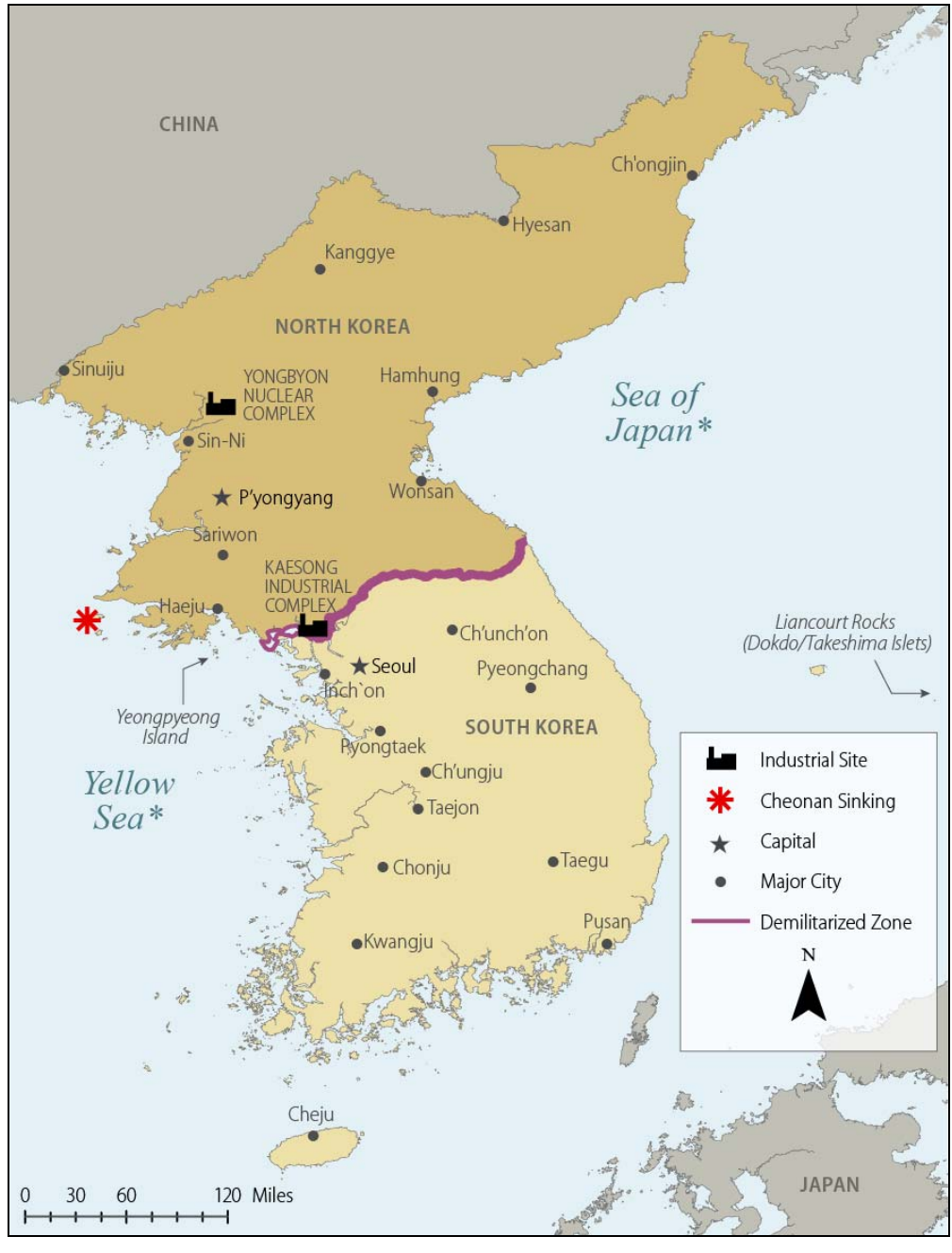
Figure 2. Map of the Korean Peninsula

Sources: Map produced by CRS using data from ESRI, and the U.S. Department of State's Office of the Geographer.