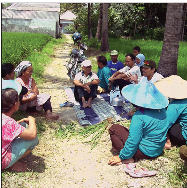
Indonesian Field School farmers discuss the ecological management of insect pests found in their paddy fields.