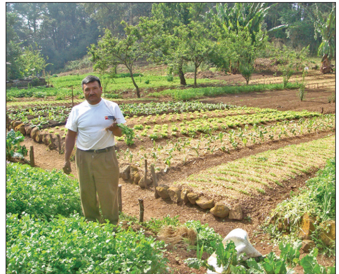
An organic farmer in Mexico practices crop rotation, applies mulch for weed control, uses organic fertilizers and maintains an agroforest to protect local springs that provide clean irrigation water.

Similarly, a comprehensive examination of nearly 300 studies worldwide by the University of Michigan concluded that organic agriculture could produce enough food, on a per capita basis, to provide 2,640 to 4,380 kilocalories per person per day (more than the suggested intake for healthy adults). Organic farms in developing countries were found to outperform conventional practices by 57%. These promising findings may underestimate the full potential of agroecological farming to contribute to increased farm-level productivity, household income and food security, as only a very small