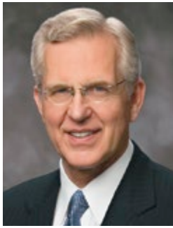
By Elder D. Todd Christofferson Of the Quorum of the Twelve Apostles