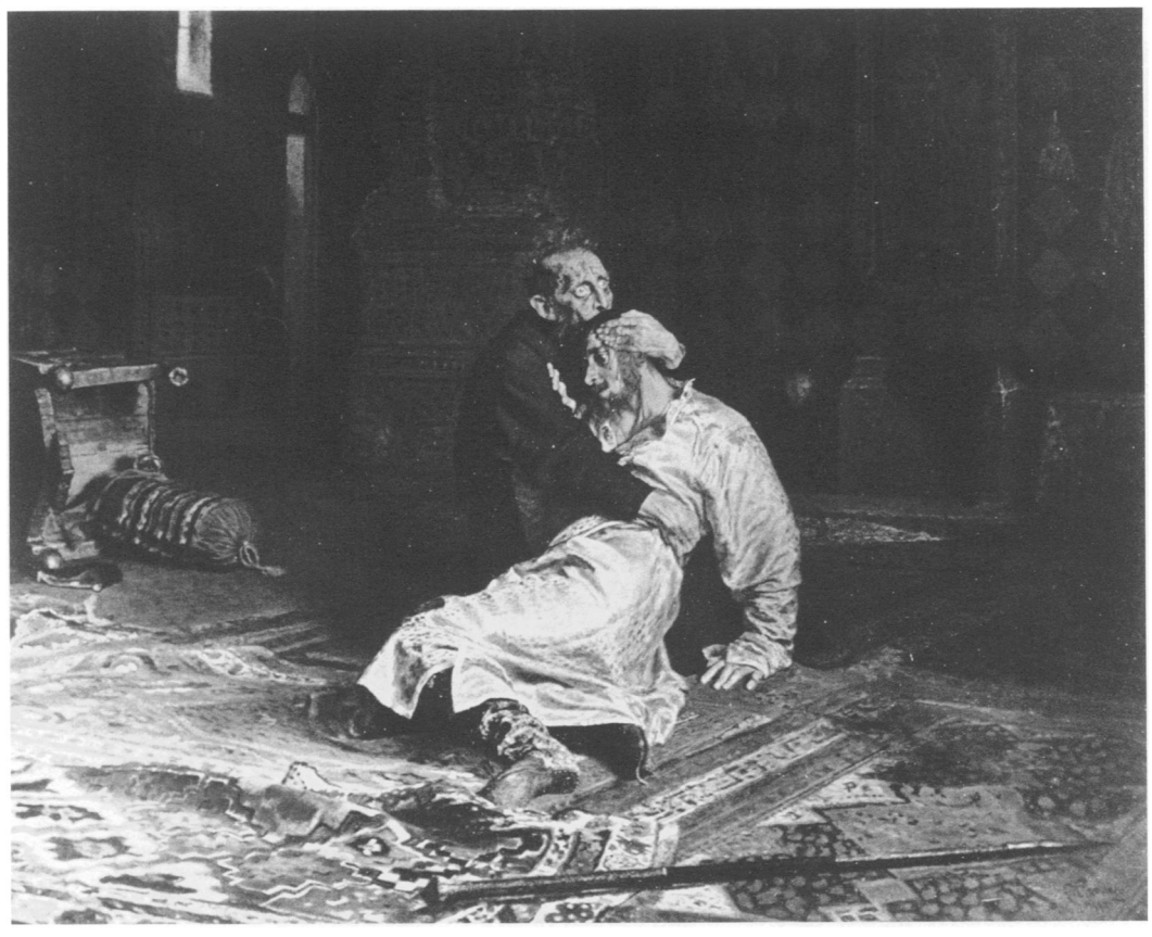
Figure 2. Ilya Efimovich Repin, Ivan the Terrible and His Son, Ivan , 1885. Oil on canvas, 199.5 x 254 cm. Moscow, State Tretiakov Gallery

sion, however, was not Garshin's physiognomy (he was not the only model; Repin painted a similar study of another artist, Vladimir Menk) but his personality and views. It was these attributes that helped Repin to arrive at a satisfactory and integrated conception of the scene.