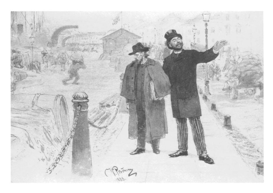
Figure 5. Ilya Efimovich Repin, Riabinin and Dedov, Illustration for Garshin's story "Artists," 1888. India ink, pen, and brush, 24.3 x 34.2 cm. St. Petersburg, State Russian Museum

positive personality and more as one who questioned the consequences of noble aspirations willfully acted out—both for himself and for society. Such questions were implicit in "Red Flower," a short story Garshin published in the fall of 1883. Its subject is a madman set on destroying a flowering red plant—the incarnation of evil in his eyes—growing in the asylum garden. The story can be read as an allegory on the degeneration of rigid ideals into sick obsession.