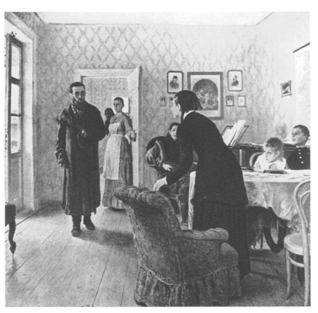
Figure 4. Ilya Efimovich Repin, They Did Not Expect Him , 1884. Oil on canvas, 160.5 x 167.5 cm. Moscow, State Tretiakov Gallery

One could argue with some plausibility that Repin's close association with the introspective and doubt-ridden Garshin during 1883–84 led him to think of the radical less in terms of an unequivocally