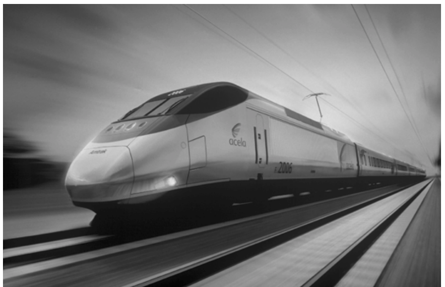
Artist's impression of Acela Express

Partially in response to these international developments, Congress passed the High Speed Ground Transportation Act of 1965, creating the Office of High Speed Ground Transportation and appropriating $90 million for R&D in the field of faster