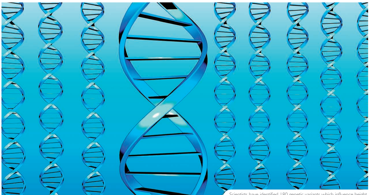
Scientists have identified 180 genetic variants which influence height.

Social factors can play a key role in whether or not a child is diagnosed as autistic