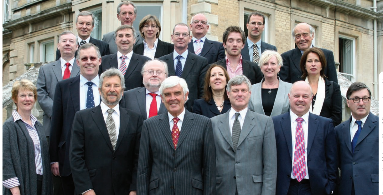
Members of the University Council (its governing body).