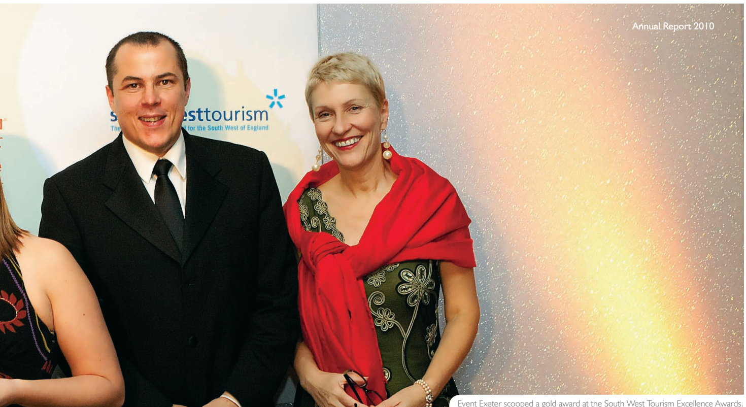
Event Exeter scooped a gold award at the South West Tourism Excellence Awards.

Finance Services was awarded Platinum-level employer status from the Association of Certified Chartered Accountants.