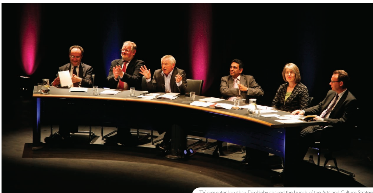
TV presenter Jonathan Dimbleby chaired the launch of the Arts and Culture Strategy.