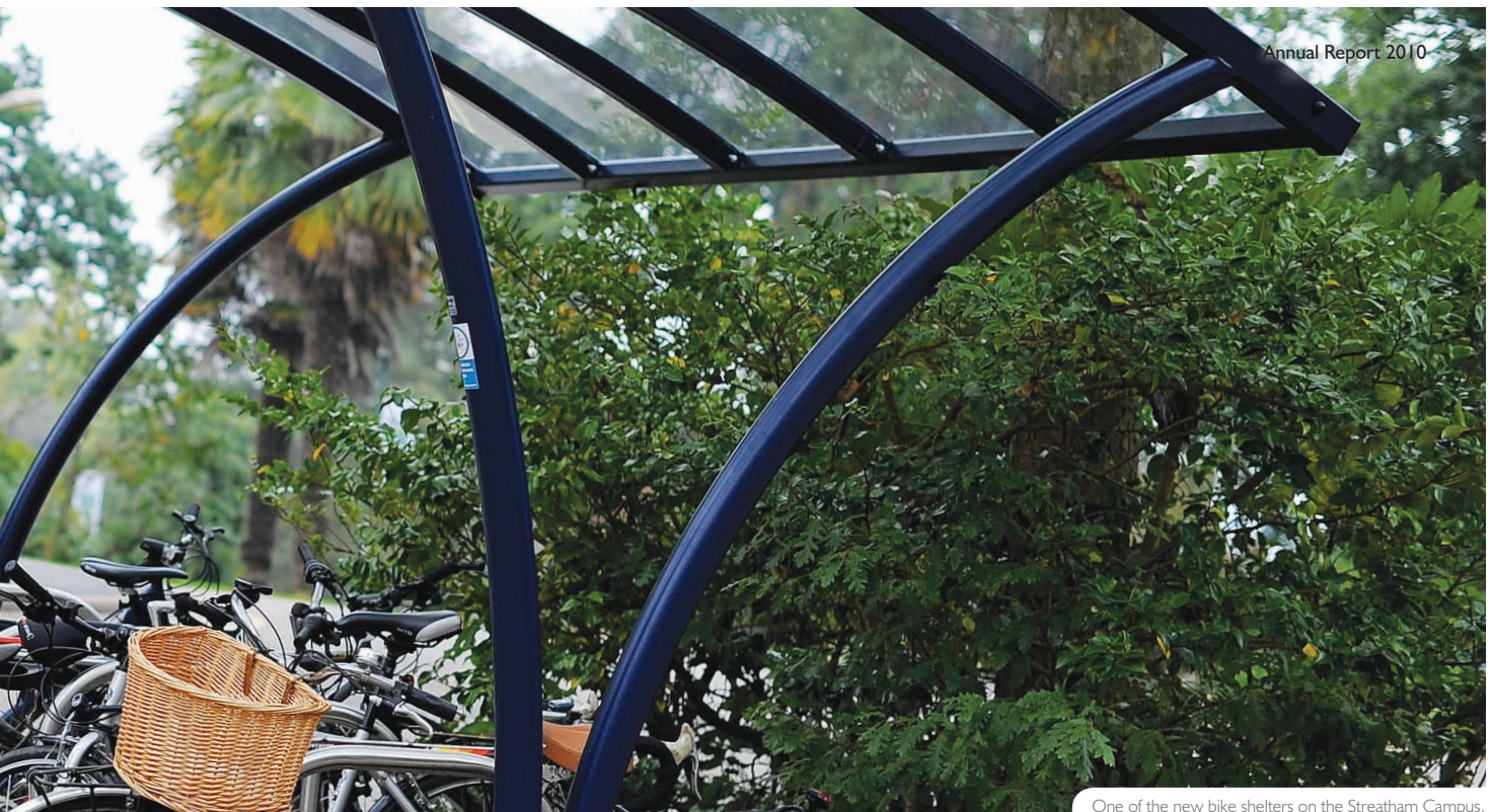
One of the new bike shelters on the Streatham Campus.