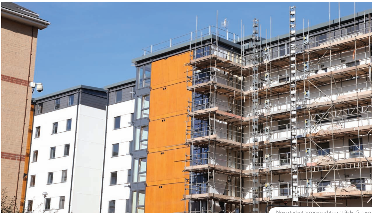
New student accommodation at Birks Grange.

In summary, the University has enjoyed an exceptionally strong performance in 2010 and can look forward to the new market conditions ushered in by Browne with confidence. We have a strong brand, wonderful new facilities ready for 2012, engaged, high quality students and committed, talented staff. We expect the University to continue to prosper in the years ahead, making a strong and increasing contribution to the regional and national economy.