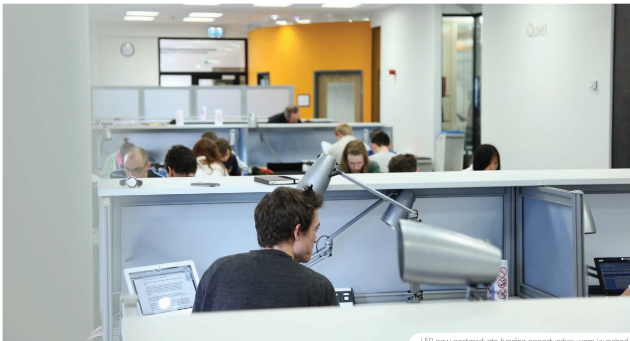
150 new postgraduate funding opportunities were launched.

The Innovation Centre continues to host over 35 knowledge-based businesses who aim to grow through association with the University.