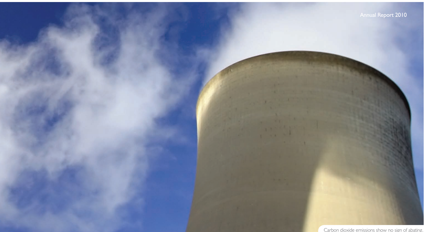
Carbon dioxide emissions show no sign of abating.

found that despite the major financial crisis last year, global CO 2 emissions from the burning of fossil fuel in 2009 were only 1.3 per cent below the record 2008 figures. This is less than half the drop predicted.