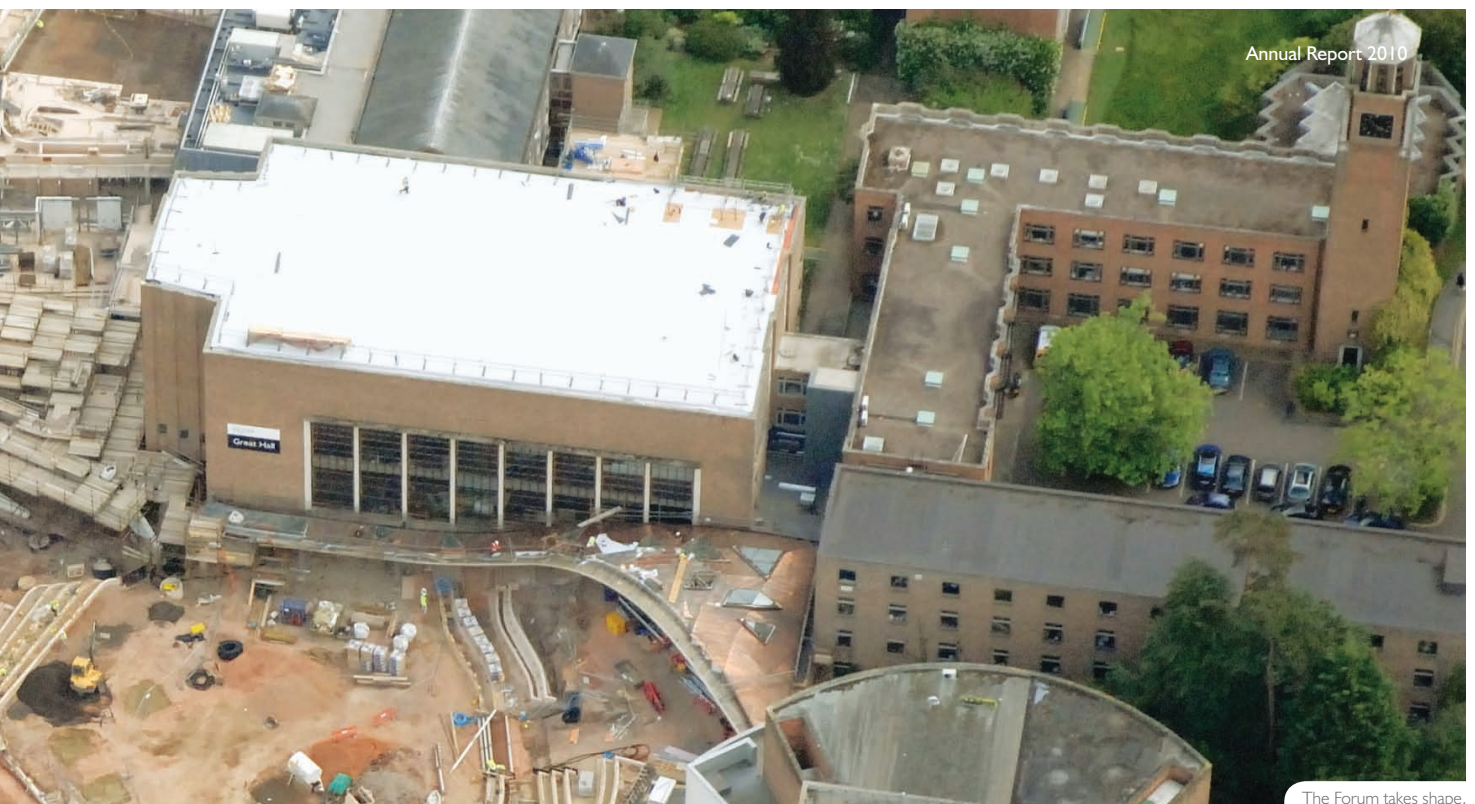
The Forum takes shape.