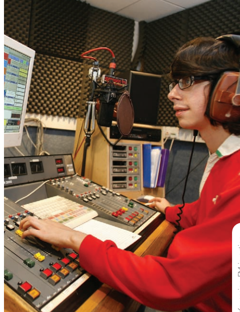
Xpression FM in action.