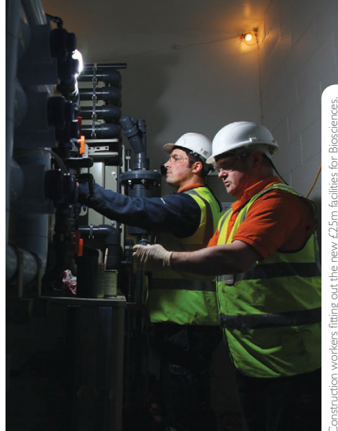
Construction workers fitting out the new £25m facilities for Biosciences.