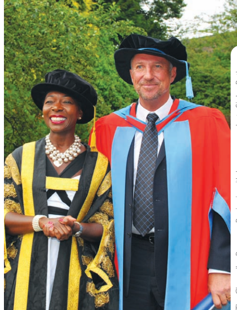
The Chancellor Baroness Benjamin with honorary graduate Sir Ian Botham.