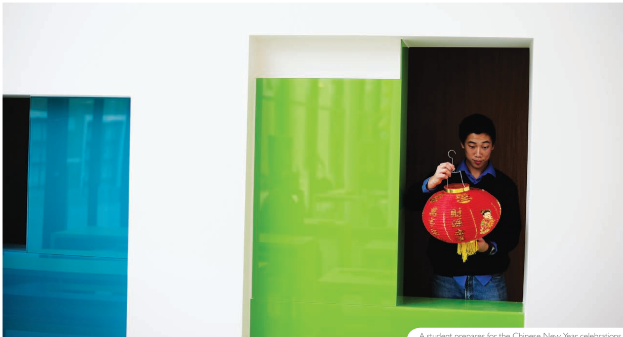
A student prepares for the Chinese New Year celebrations.

International students are becoming increasingly engaged in the life of the city of Exeter. The Chinese Students and Scholars Association organised comedy sketches, martial arts and mask painting to celebrate the Chinese New Year. Students from the University's Kurdish Society arranged an evening of cultural activities and a lecture to mark their New Year, 'Newroz'. Exeter's Hindu students also celebrated Diwali, the Hindu Festival of Light.