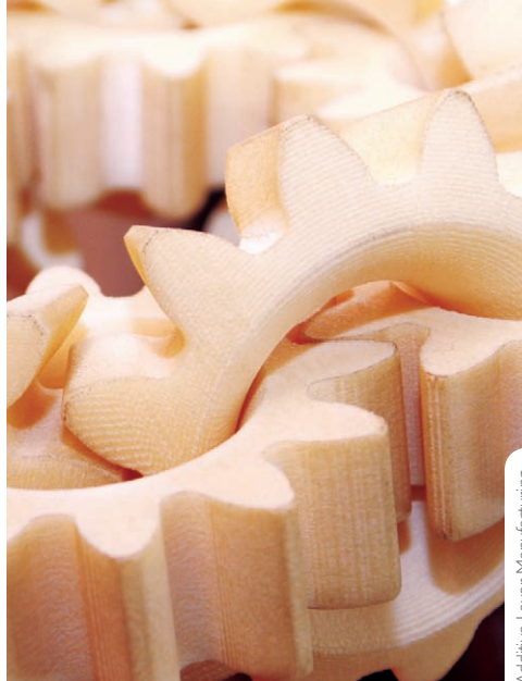
Additive Layer Manufacturing.