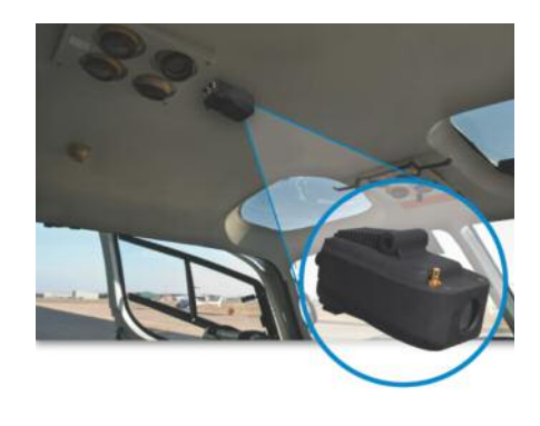
Vision 1000 Low cost image & cockpit recorder + basic HFDM