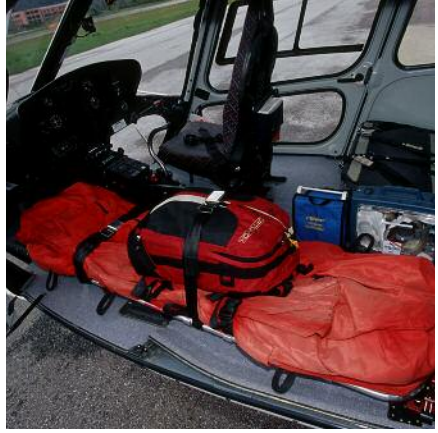
Emergency Medical Service kit

Infrared thermal imaging system (both modes can be recorded or transmitted via microwave downlink), moving map with zoom and GPS, tracker for following or locating stolen property or vehicles, wire-strike protection system, gyro-stabilised binoculars, simultaneous 4- channel police radio.