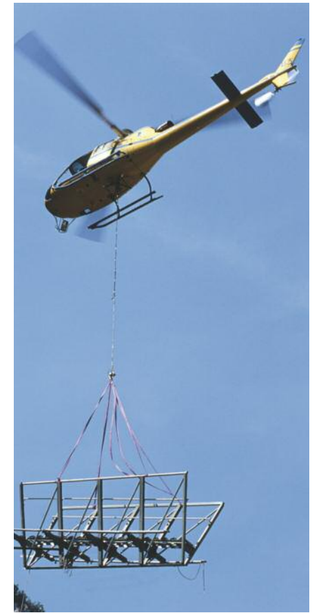
Air crane operations