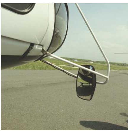
Electrical external mirror