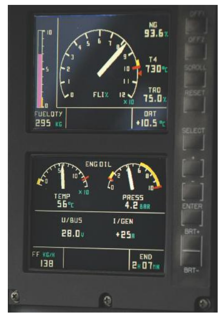
VEMD display in flight

The VEMD considerably reduces the flight crew's workload and improves safety, as the pilot can see all the parameters at a glance, including First Limit Indicator (FLI) and concentrate solely on his mission.