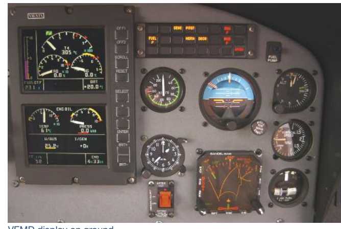
VEMD display on ground