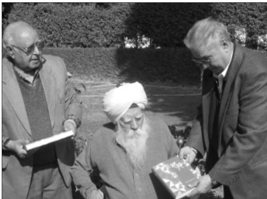
With admirers from Germany a few days before he passed away.

He continued his writing work, though the pace was slower. He was as alert as ever, but physical infirmities irritated him. Yet, he retained his sense of humour and on Lohri day, he joked around at home and basically brought cheer back into our lives.