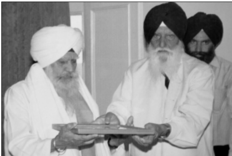
Jathedar Gurcharan Singh Tohra presenting a memento on behalf of the Sikh Educational Society, to Giani Gurdit Singh, recognising his "valuable services in the field of literature" at a public function held in Chandigarh on April 7, 2002.

Path bodh samagams were held, the first one at Teja Singh Samundri Hall, Amritsar, and subsequently in Ludhiana, Sri Guru Singh Sabha, Dadar, Mumbai, Takht Sri Damdama Sahib, Talwandi Sabo, and Gurdwara Rakab Ganj, Delhi. Path Bodh samagams were arguably the first multi-disciplinary endeavours to understand Gurbani contained in Guru Granth Sahib. Scholars of various languages and traditional granthis together read Guru Granth Sahib and each line was discussed and debated upon so that its meaning, grammar and pronunciation and punctuation was clear. These samagams were at least three-day affairs.