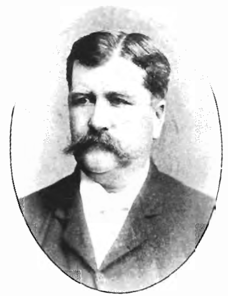
The Hon. Sir JOHN ROBINSON, K.C.M.G., M.L.A. (PREMIER COLONIAL SECRETARY & MINISTER OF EDUCATION)

The first Premier of Natal, 1893