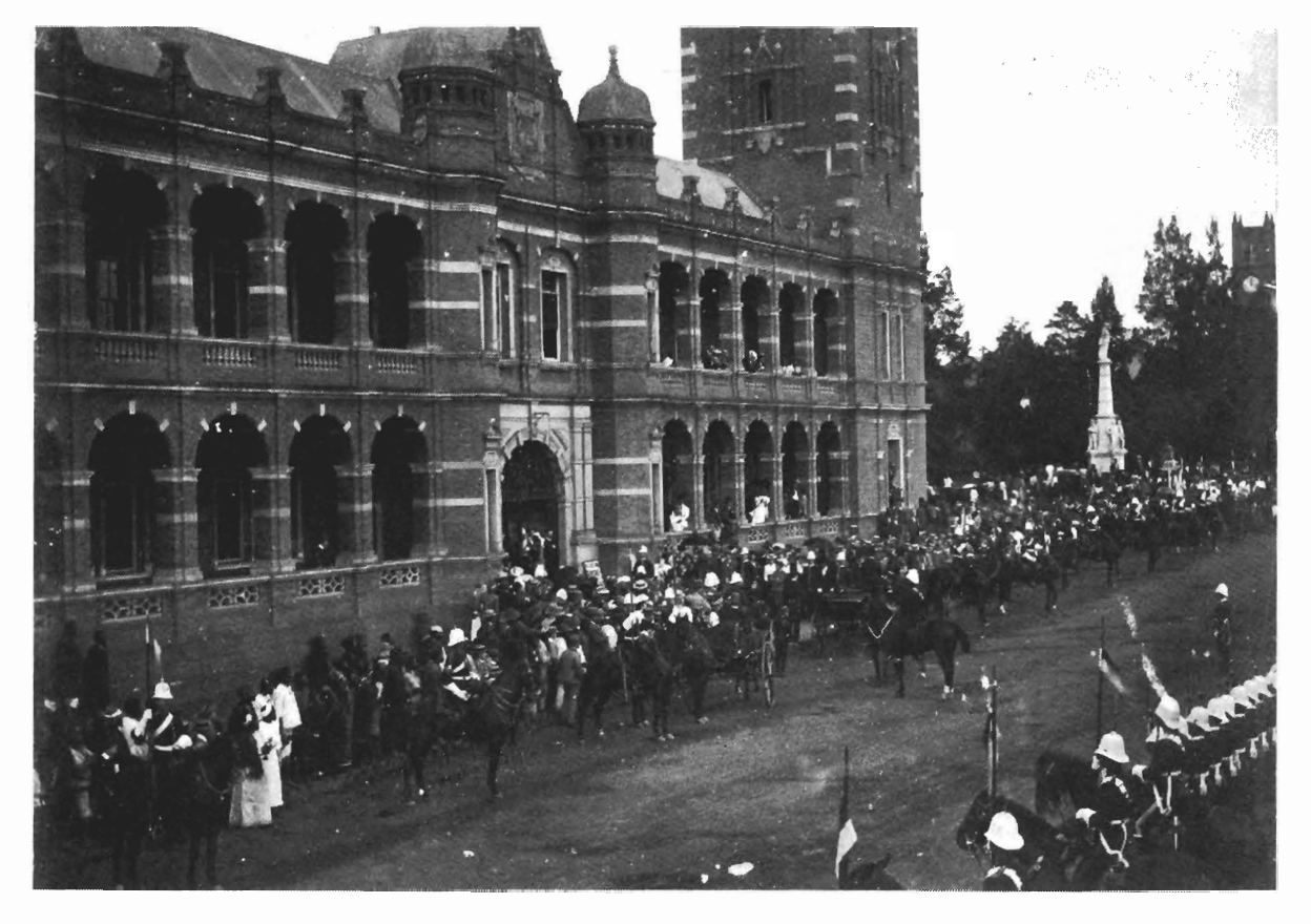
'Imperial Splendour': Opening the first Natal Parliament, 19 October 1893, by Sir Walter Hely Hutchinson.