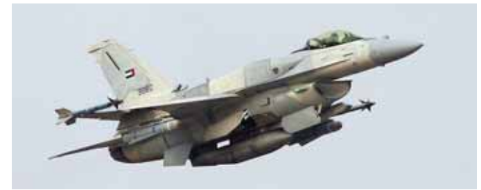
The F-16E/F Block 60, operated only by the UAE, is more advanced than the F-16C/D Block 50s of the U.S. Air Force.

adversaries."<sup>2</sup> While such policy is intended to prepare U.S. forces to achieve air dominance, the resulting aircraft do not fit the requirements of potential export customers. Decisions by Thailand and Indonesia—F-5 and F-16 users—to buy 4.5th generation Saab JAS 39 Gripens and Sukhoi Su-30s reflect this. Though small, these sales demonstrate that the competition understands customer demand and is striving meet it.