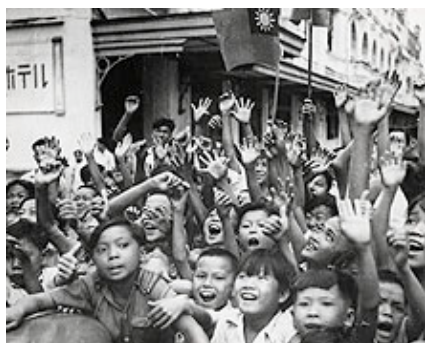
Children cheering the arrival of the Allied Forces after the recapture of Singapore. Soon after that, the British declared pre-war currency as legal tender, making Japanese 'banana' money worthless.

Three days after the emperor's announcement, Itagaki flew to Saigon (Ho Chi Minh City) to meet Field Marshal Count Terauchi, Commander of the Japanese Southern Army and forces in South-east Asia.