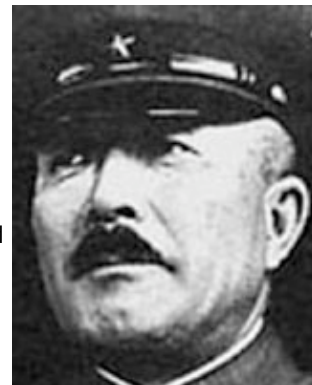
General Itagaki, commander of the Japanese 7th Area Army, had initially balked at the order to surrender.

But on Aug 20, Itagaki signalled Mountbatten that he would abide by his emperor's decision and was ready to receive instructions for the Japanese surrender of Singapore.