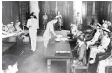
EIGHT DAYS BEFORE THIS FORMAL SURRENDER at City Hall on Sept 12, 1945, the Japanese had already agreed to surrender their forces and accept British military rule.

SINGAPOREANS who lived through World War II would remember pictures of Lord Louis Mountbatten taking the Japanese surrender in the City Hall chambers on Sept 12, 1945. But this was not the real Japanese surrender.