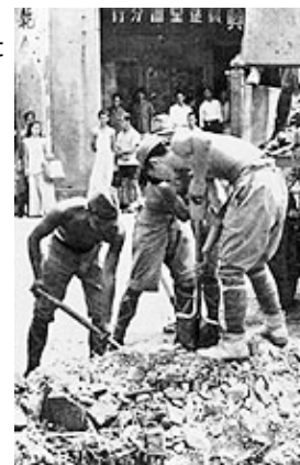
Japanese prisoners of war being put to work. A few of the Japanese soldiers fled into the jungle after the surrender.

Defeat made strange bedfellows, as close to 200 Japanese soldiers decided to join the communist guerillas whom they were fighting just days before in a bid to continue the fight against the British. It was only when they found out that the Malayan Communist Party-funded Malayan People's Anti-Japanese Army did not plan to fight the returning British that many Japanese soldiers returned to their units.