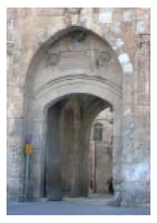
Gate into the Old City of Jerusalem

Under considerable pressure from highplaced American Zionists, the UN decided to give away 55 percent of Palestine to a Jewish state — despite the fact that this group represented only about 30 percent of the total population, and owned under 7 percent of the land.