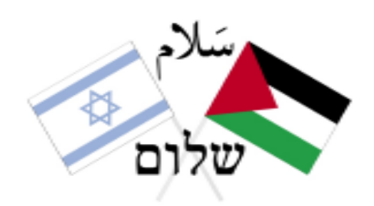
Israel and Palestine flags with "Peace" in Hebrew and Arabic

UNITED METHODIST WOMEN - United Methodist groups that works to raise awareness of the concerns and responsibilities of the Church in the world, with special attention to the needs of women and children. For more information about work and action related to Palestine and Israel visit the website: <a href="http://new.gbgm-umc.org/umw">http://new.gbgm-umc.org/umw</a>. ❖