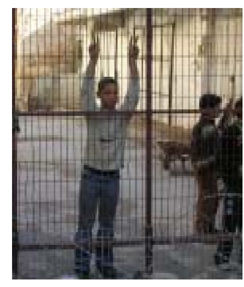
Palestinian Boy in Hebron

Second, Israel's continued confiscation of Palestinian land in the West Bank and Gaza is being resisted by the Palestinian inhabitants. It is these occupied territories that, according to the Oslo peace accords of 1993, were going to become a Palestinian state. However, when Israel continued to take land in these areas and to move its citizens onto it, the Palestinian population rebelled. This uprising, called the "Intifada" (Arabic for "shaking off") began at the end of September 2000 and continues to this day. ❖