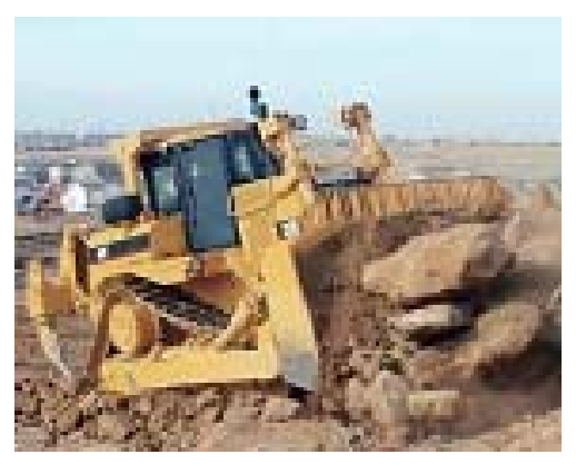
A 50-ton Caterpillar D9T bulldozer. This and similar Caterpillar models are sold to the Israeli government and used to demolish Palestinian homes.

The GBPHB follows the mandates of the church. The mandates of the church issue forth from General Conference. We depend