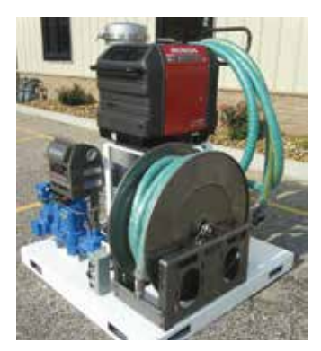
Portable – Onsite metered distribution