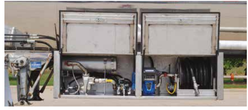
Bulk – Bulk delivery and transport for 1-1/4" and 1-1/2" hose

No matter what your application, Hannay diesel emission fluid reel packages will fit your needs.