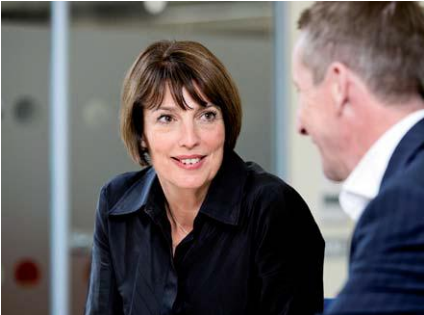
CAROLYN MCCALL OBE