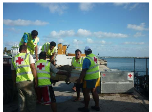
TRCS volunteers loading the desalination unit onto the boat to be taken to Nukulaelae island. During the first joint assessment of the situation in Nukulaelae, TRCS also delivered 10,000 litres of water to the communal water tank, water containers and tarpaulin packs.

<click here to view the map of the affected area, or here for detailed contact information>