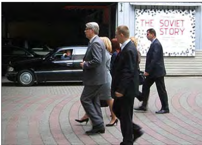
Riga. May 7, 2008. President of Latvia, Valdis Zatlers, visits a theater to watch 'The Soviet Story'.