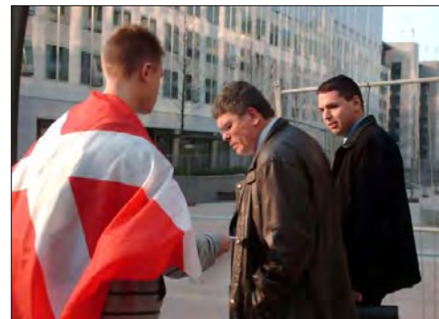
Brussels. April, 2008. Activists of pro-Kremlin youth organization 'Nashi' stage protest against 'The Soviet Story' outside the European Parliament. http://tashkent.nashi.su/news/23864