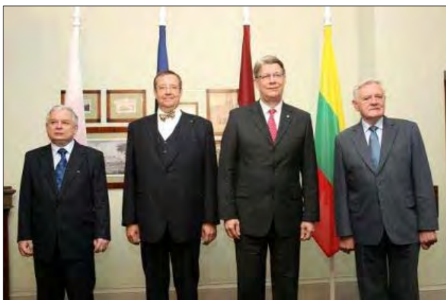
Riga. May 22, 2008. President of Latvia, Valdis Zatlers presents 'The Soviet Story' film DVDs to the presidents of Poland, Estonia and Lithuania.