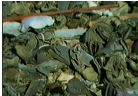
Shoes of murdered victims: