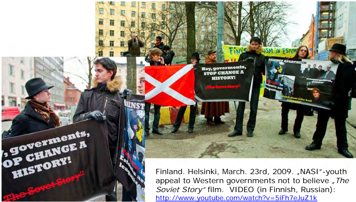
Finland. Helsinki, March. 23rd, 2009. „NASI“-youth appeal to Western governments not to believe „ The Soviet Story “ film. VIDEO (in Finnish, Russian): http://www.youtube.com/watch?v=5iFh7eJuZ1k