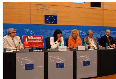
Brussels. May, 2008. UEN Group in the European Parliament condemn the uncivilized protests against 'The Soviet Story' in Moscow, May 17, 2008.