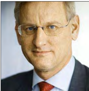
Carl Bildt, Foreign Minister of Sweden

Carl Bildt [June 27 th , 2008]: " The Soviet Story " is a film, which will certainly be talked about in the coming months. This film is perhaps a beginning of understanding of what the Soviet regime meant for a half of Europe."