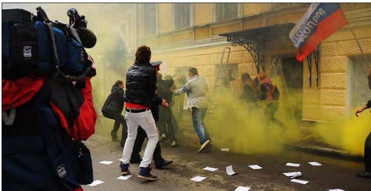
Protests against the film 'The Soviet Story' in Moscow.