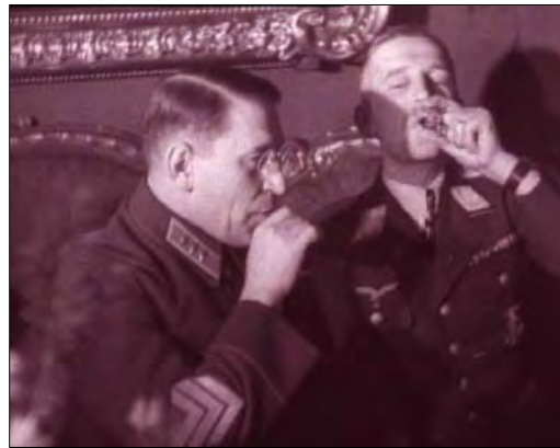
Soviet and Nazi officers, December 1939.

These are just a few of the subjects covered in the film.