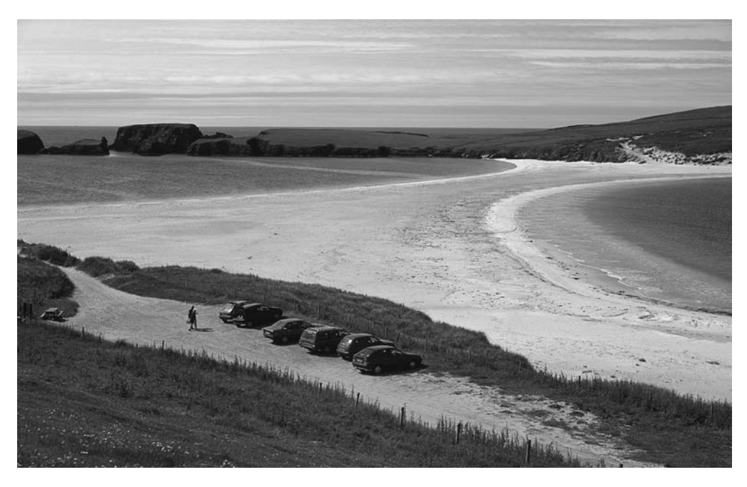
Figure 8.23: St Ninian's tombolo, looking south-west towards St Ninian's Isle. Dunes flank either extremity of the sandy tombolo. During the highest spring tides the central part may be completely covered in water.

St Ninian's tombolo, the largest geomorphologically active sand tombolo in Britain, is a classic geomorphological feature of national importance. The tombolo links the south-west Shetland Mainland to the small off-lying island of St Ninian's Isle (Figure8.23). Although tombolos are by no means rare in an archipelago environment, they are numerically scarce relative to other classic forms of marine deposition (spits and bars). In the Northern Isles, tombolos (ayres) are generally formed of gravel, cobbles or occasionally boulders. St Ninian's tombolo is distinctive among its fellows in being composed mainly of sand. In addition, unlike many other ayres that are relict in terms of their evolution and relationship to contemporary sea level, St Ninian's tombolo is a geomorphologically active feature linked to a nearshore sediment circulatory system (Nature Conservancy Council, 1976; Smith, 1993; Bentley, 1996d). The tombolo is flanked on either end by areas of dunes and hill machair, enhancing the geomorphological interest. This almost perfectly formed feature set in a highly scenic part of the Shetland Isles must be one of the most outstanding tombolos in the world.