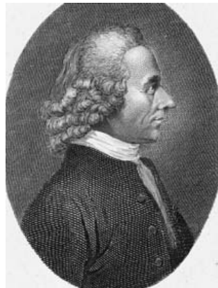
Joseph Priestley, elected 1782, FHM.