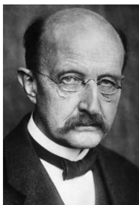
Max Karl Ernst Ludwig Planck, elected 1914, FHM.

Career description: Mathematician; Astronomer; Educator; Academic research institution administrator