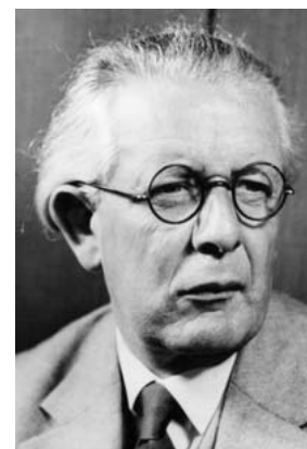
Jean Piaget, elected 1957, FHM.