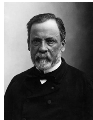
Louis Pasteur, elected 1883, FHM.