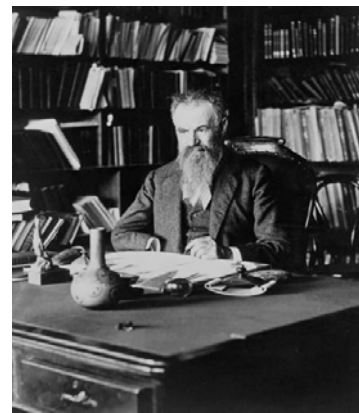
John Wesley Powell, elected 1887, Associate Fellow.