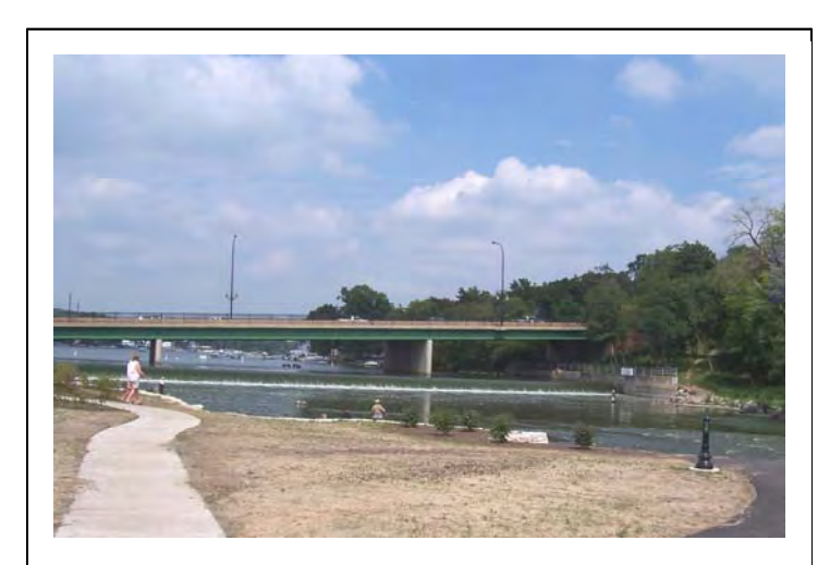
Cornish Park provides for scenic vistas and opportunities for recreation and community events in the heart of the Old Town District.

The Village of Algonquin is striving to "create a community where one can live, work, shop and play." This plan will focus on the "play" portion of that statement. All elected officials, village staff and residents share the need and desire for parks, open spaces, and bike It is beneficial to community, environment. and individual health of residents to have a variety of spaces. The community enjoys public events held in our parks (summer band concerts at Riverfront Park, Founder's Days at Towne Park, Conservation Community Day along Woods Creek Trail, and sporting events at various parks such as Kelliher Park and Presidential Park).