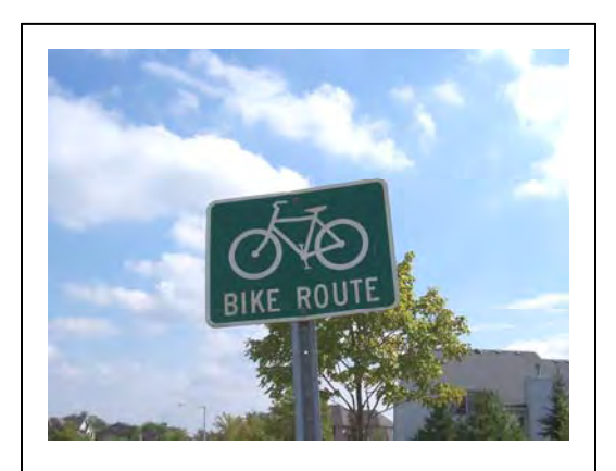
This sign on Stonegate Road, a Class I trail, lets bicyclists and motorists alike know of the existence of a bike route along the road.

The trail system in the Village has three different types of trails as described below.