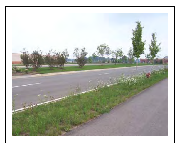
Completion of the Corporate Parkway Trail is ongoing as development of the Algonquin Corporate Campus progresses.

The Prairie Path Subdivision (Cowhey Property) Trail System will be a series of Class III trails running through the proposed Prairie Path subdivision on the Village's east side. This trail system would serve residents of the neighborhood with a variety of trail loops and would also connect to the Presidential Park Trail System, the