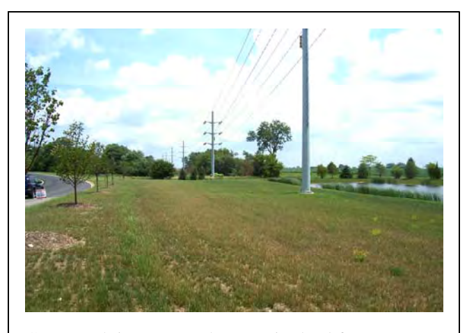
Coves Park is a proposal to acquire land for usage as a neighborhood park with both passive and active recreational facilities.

Algonquin Corporate Campus Greenbelt is a greenbelt, located in the Algonquin Corporate Campus Phase III, extending from Ted Spella Park southward, going through a residential neighborhood and an industrial