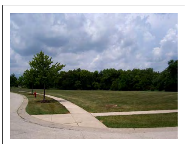
The development of Lawndale Park in Willoughby pedestrian trail.

Lawndale Park is a park that is located in Willoughby Farms off of Lawndale Drive. This approximately 9.24 acre property already has had a concept plan developed for it, as well as a public input session held in 2006. The park was originally intended to include pathways,