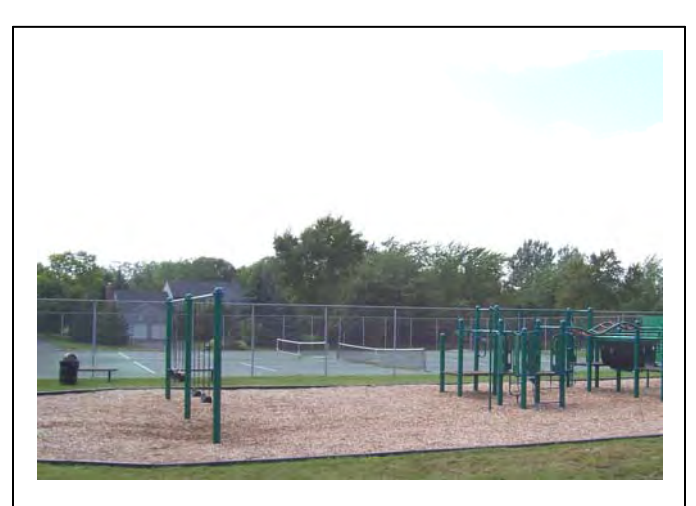
Gaslight Park, a smaller park located in the Gaslight neighborhood, is a neighborhood park which provides convenient recreation for neighborhood residents.

Neighborhood parks are small parks (1-12 acres) designed to serve the neighborhood in which they located. The size of the park may vary dependent on the types of facilities featured at the park and the population of the area it is intended to serve. The park should generally be located in a residential neighborhood, easily accessible, and located within one-half mile of the residents it is intended to majority serve. The of each neighborhood park should not be located in the flood plain. When developing a neighborhood park,