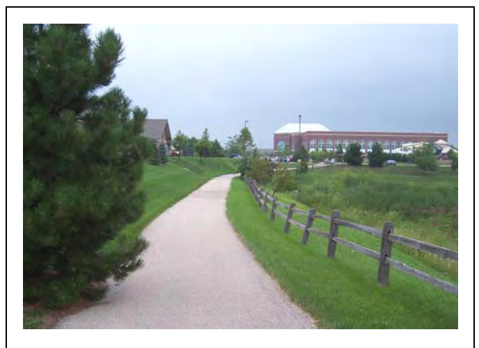
The Lifetime Fitness Connector currently connects to the Bunker Hill-Huntington Trail. An extension of the trail from Lifetime Fitness northward would provide a connection to a future trail.

The Arbor Hills – Falcon Ridge Trail would provide a trail for residents in the northern portion of the west side of Algonquin, and would connect the Arbor Hills and Falcon Ridge Parks, with connections to Lifetime Fitness and the High Hill Park/Village Hall Trail System. The trails would be predominantly Class I, running on streets adjacent to and between the parks. The proposed route would run along Stonegate, Salford, Buckingham, Huntington, and Aberdeen Drives. Trails may be able to go through some limited wooded or forested upland areas of the