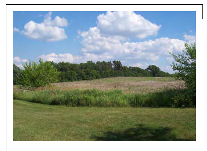
An extension of Willoughby Farms Park will be made possible by the Aspen Village development. This park extension would be a prime location for a skate park.

This section includes areas of open space currently owned by developers, home owners' associations, and the like. These are parcels that the Village would like to develop into parks and recreational areas. As these parcels are currently not owned by the Village, they are highlighted in blue on the Parks, Trails, and Open Space Map. Each additional residential subdivision shall include a park donation and connect to the trail system if possible.