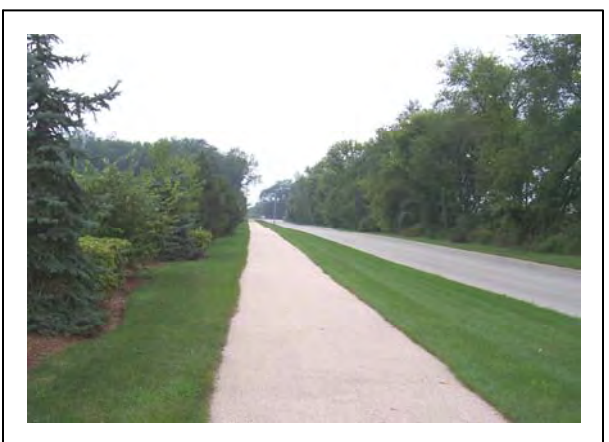
Longmeadow Parkway Trail runs along the southern edge of what is poised to become an important regional transportation corridor.

The Sleepy Hollow Road Trail is a Class II trail which runs along the western side of Sleepy Hollow Road, serving residents in the Willoughby Farms neighborhood and also