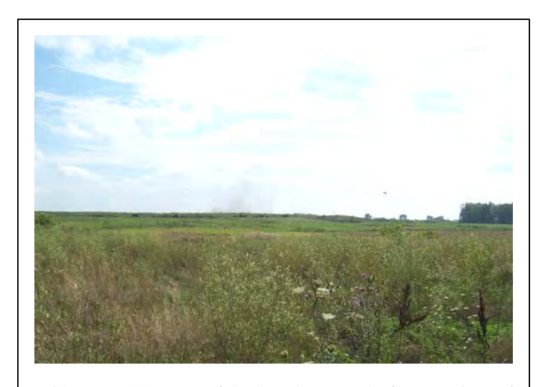
With over 100 acres of land and proposals for a variety of community recreational facilities, as well as large expanses of natural preserves, the proposed Ted Spella Park is poised to become the Village's largest and most all-encompassing park.

This section includes parks that are currently under development, under construction, or that have begun adding facilities to them.