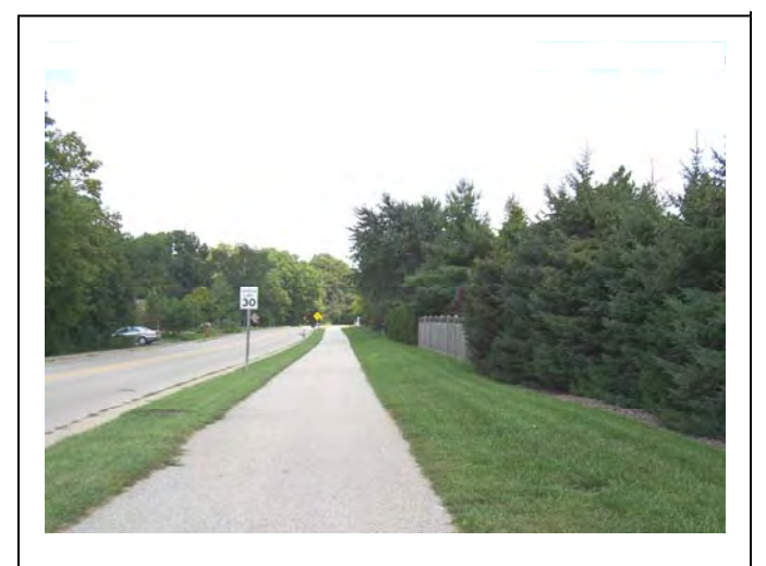
The Highland Avenue Trail, a Class II trail pictured above, is just one of many trails in the Village.

The most significant trail within the Village is the Prairie Path/Fox River Trail operated by the McHenry County