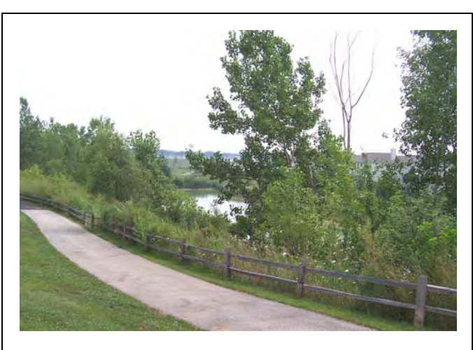
Algonquin Lakes North is a large expanse of land, featuring two lakes, natural preserves, and a system of bike paths. Some passive facilities could be added.

Arbor Hills Nature Preserve is a 15.44 acre parcel located in the Arbor Hills subdivision at 245 Stonegate Road. This area is preserved predominantly as a