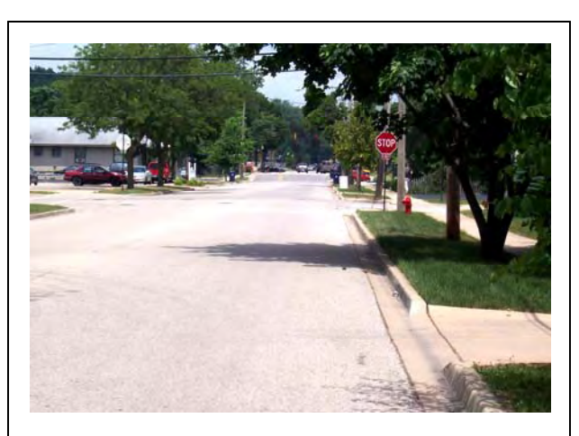
On-street Class I trail designations on downtown streets such as Harrison Street, pictured here, would be made as part of the Old Town Trail System.

The Old Town District Trail System would be a series of on-street or on-sidewalk Class I designations in the Old Town District in order to connect trail systems on the west with trail systems on the east, as well as create a bikefriendly environment in the Village's Old Town District. The Class I trail would primarily run along Jefferson Washington Street, Harrison Street, East Algonquin Road, and North Hubbard Street, with spurs to Towne Park and Riverfront Park, and providing connections to the Prairie Path/Fox River Trail, including using an existing ramp at the end of South Harrison Street and making an additional connection to the Prairie Path and Towne Park at the end of