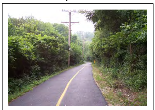
A portion of the McHenry County Prairie Path, a county-operated trail which runs through the heart of the Village.

Hill Climb Trail System is a Class III trail system which runs throughout Hill Climb Park,