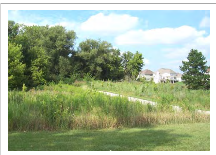
Additional development of the Woods Creek Corridor should be limited, with a few complimentary facilities such as restrooms, viewing stations, and benches added.

park. This is currently owned by Par Development. This area could include benches, a picnic area, and pathways. The Greenbelt is likely to be extended as adjacent properties in the campus are developed.