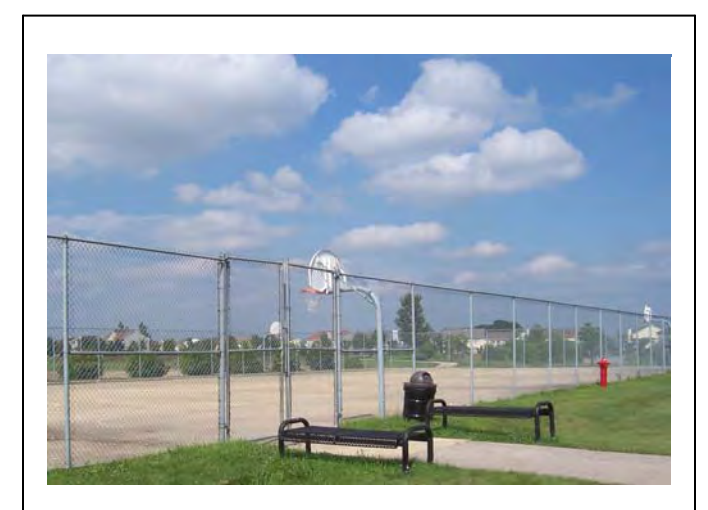
Willoughby Farms Park is a community park which features numerous active recreational facilities including ball fields, basketball courts, tennis courts, pathways, benches, a skating rink, and a playground.

Tunbridge Park is a 1.57 acre park located in a cul-de-sac greenway at 1365 Stonegate Road. This pocket park, intended to serve residents of the Tunbridge neighborhood, features a picnic shelter, playground, picnic area, open play area, and benches.