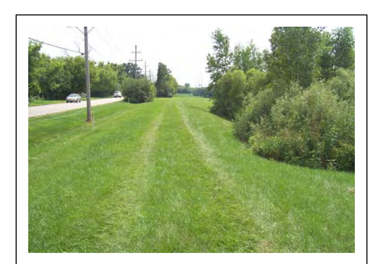
The Haeger's Bend Trail is a proposed trail which would run on a former highway right-of-way corridor. This trail would be an integral trail connecting important trails on the Village's eastern side.

The Sandbloom Road Trail completion would involve a Class II connection from the Sandbloom Road trail started by the Algonquin Lakes Trail System to the Sandbloom Road Trail as part of the Jewel development, contingent upon development of the land between Algonquin Lakes and Jewel. There would also be the possibility of connecting this trail to the Fountain Square Trail System and other retail uses across Algonquin Road through sidewalk and crosswalk connections at Algonquin and Sandbloom Roads. Full completion of the Sandbloom Road Trail would be made by extending the trail southward to connect with the Fox River Trail.