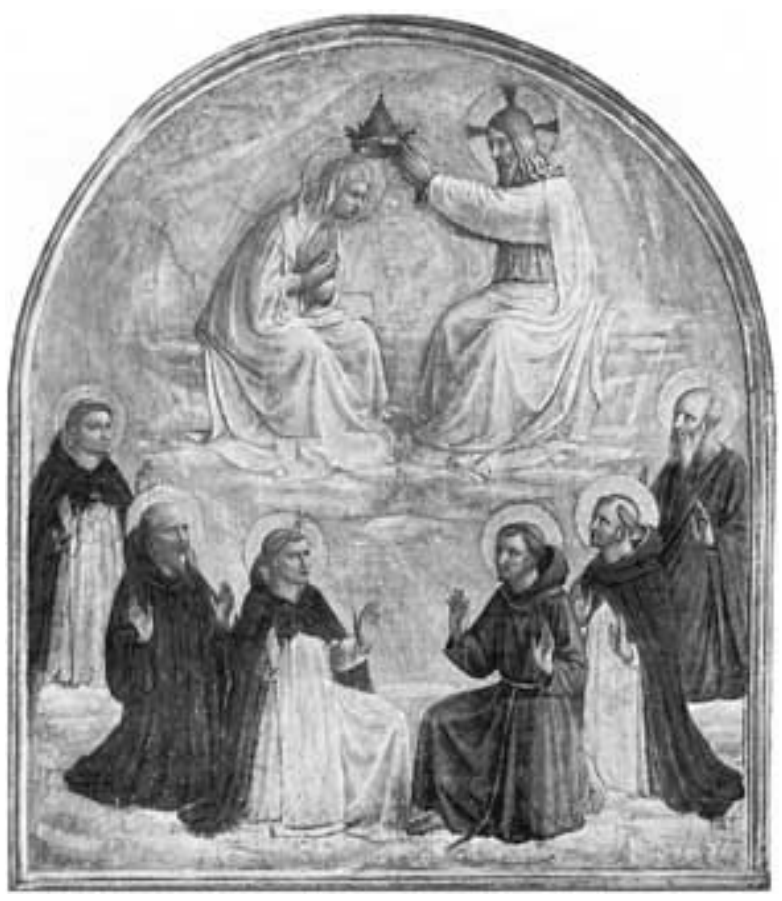
\label{thm:condition} \emph{The Coronation of the Virgin}, Fra \, Angelico, \, Upper \, floor, \, cell \, 9, \, San \, Marco, \, Florence. \, Frescoe, \, 1440-1.

This coronation scene includes the founders of the Benedictines, the Dominicans, and the Franciscans—each representing a special religious charism in the life of the Church.