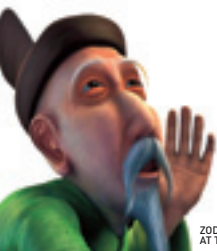
ZODIAC CREATED POSITIVE BUZZ AT THE CANNES FILM MARKET.

To give budding local talents a boost, MDA supported a suite of brand new media-related courses at various institutes of higher learning and commercial media schools.