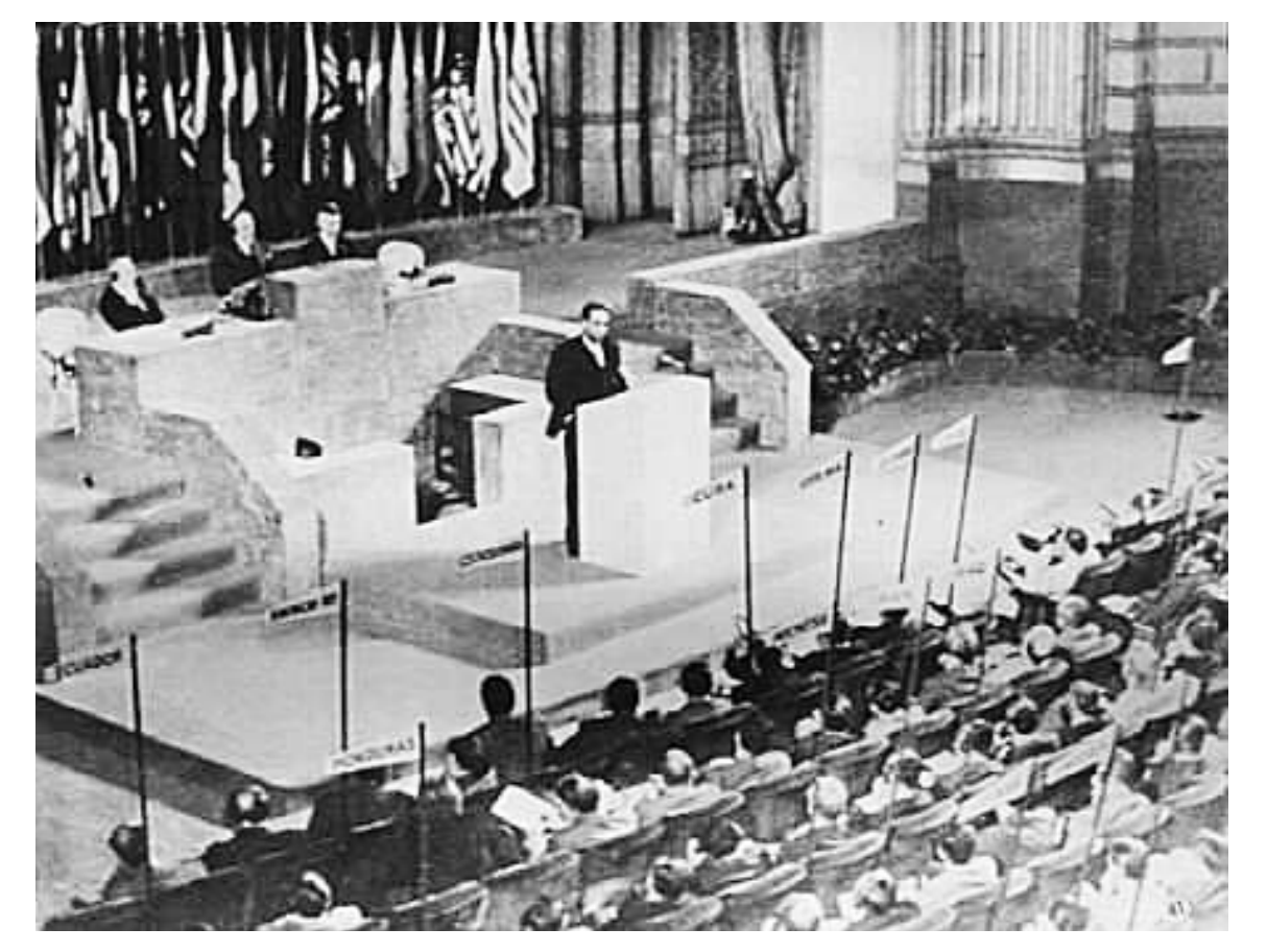
Address by J R Jayewardene Leader of the delegation of the Government of CEYLON (SRI LANKA) at the conference for the conclusion and signature of the Treaty of Peace with Japan - San Francisco, USA 6th September 1951