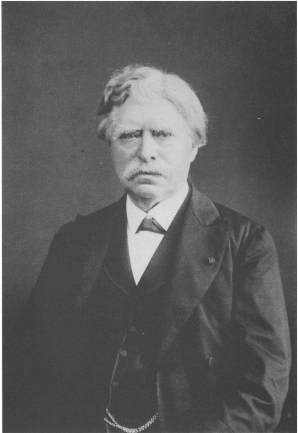
DAVID EDWARD HUGHES, F.R.S. (1831–1900) From a photograph in the Royal Society Library