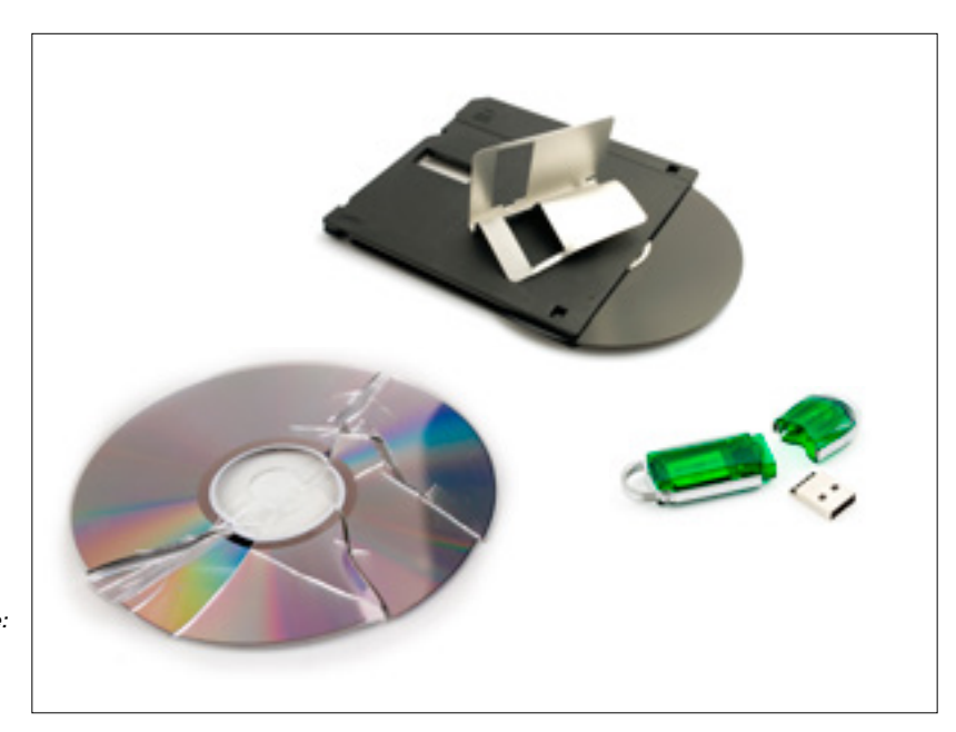
Fig.2: Digital media with physical damage: a CD, a USB drive, a 3.5" floppy disk.

the repository's agreement with the donor or dealer. Physical damage to media may also change the level of preservation and access that a repository can provide. Documenting the physical condition of the files in relation to other factors and making that information easily accessible will facilitate preservation planning. Information about physical condition may also be of interest to future researchers. Donors, dealers, and repositories should not assume that nothing of value can be recovered from digital media just because they may be decades old and battered looking.