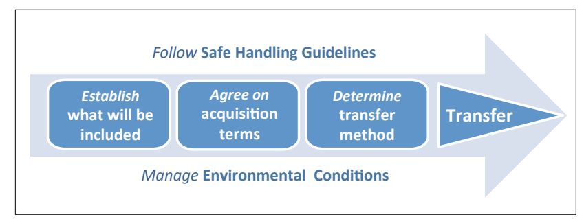
Fig.1: Components of the transfer process

from moisture, extreme temperatures, strong electromagnetic fields, and rough handling when being transferred to a repository. Any equipment should be cushioned during transport, and moving parts should be stabilized (e.g., inserting a dummy floppy disk into a floppy disk drive may be advisable). Alternatively, files may be transferred electronically by secure means. All of these scenarios will benefit from established repository protocols, easy-to-follow instructions, and tested documentation strategies to ensure that the correct files are acquired in a way that is well authenticated.