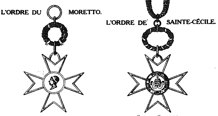
CROIX DE CHEVALIER.

One of the better known Presidents was the Danish sculptor Thorvaldsen. It was discontinued after 1870, when the Papal States ceased to exist. The name of the order was taken from the Moor's head, which in turn was taken from the coat of arms of the family of Pius VII - Chiaramonti.