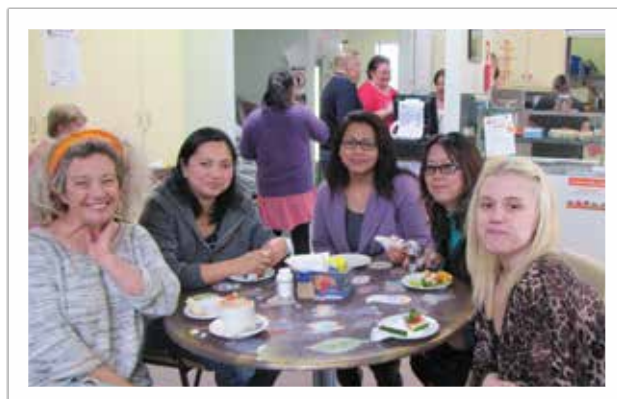
Certificate 3 in Aged, Home and Community Care course, enjoying a lunch break in the Rosewall Neighbourhood Centre Café.