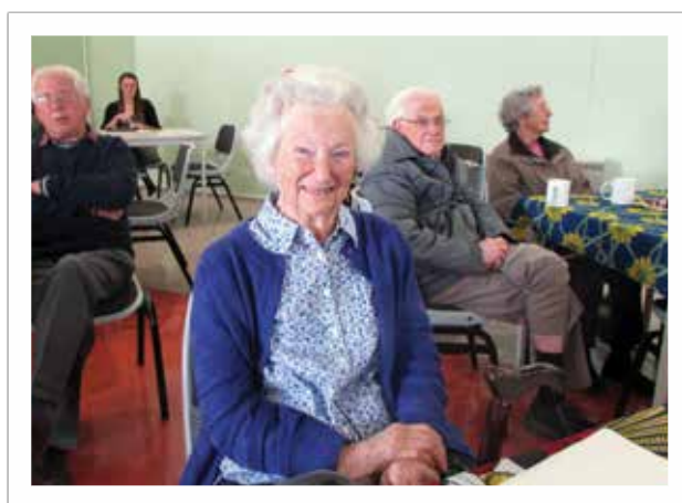
A musical soiree was held at Cloverdale Community Centre during Seniors' Week. Visitors to the centre enjoyed toe-tapping performances and the chance to sing along.