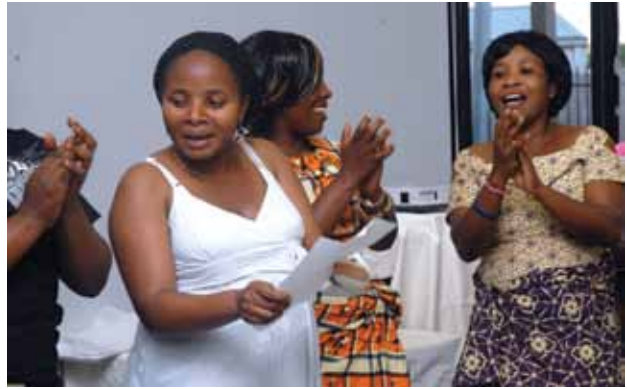
Sing along: Congolese women enjoy some singing during the Women As One dinner at Cloverdale to celebrate International Women's Day.