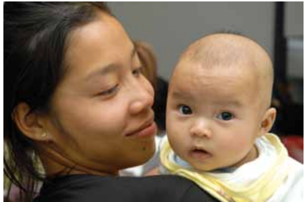
Young guest: Women of all ages attended the Women As One dinner.