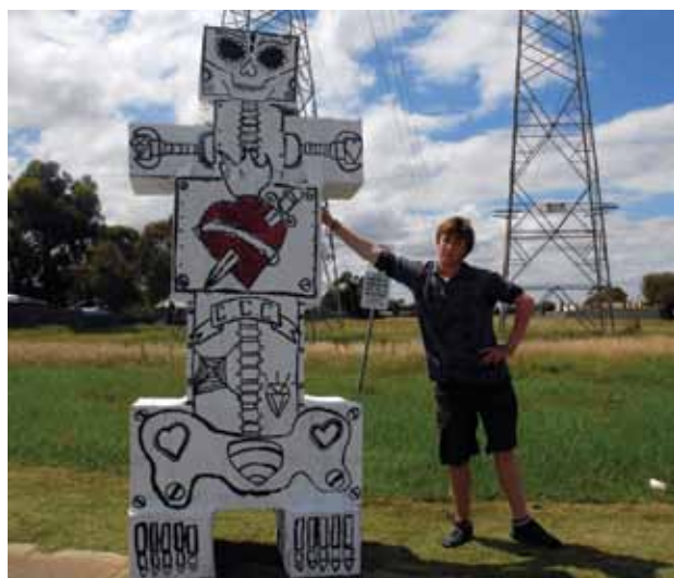
Big man: Zac Berryman with the huge sculpture created during the Less is Moore program at Cloverdale Community Centre.