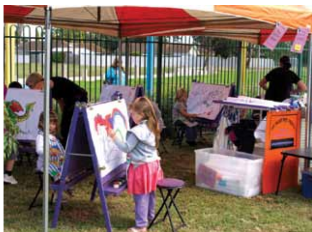
Creative: Young visitors try their hand at some art work during the Going Potty Festival at Rosewall Neighbourhood Centre.