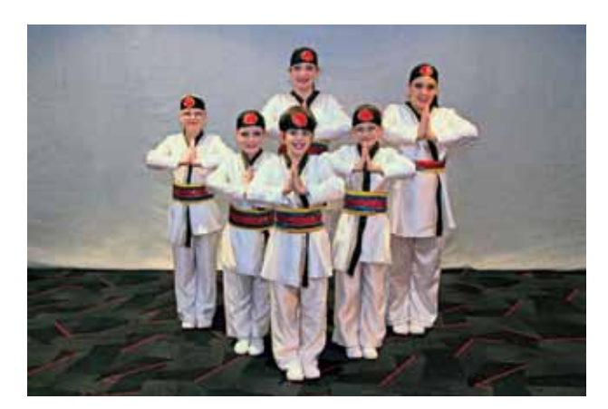
Colourful costumes are an important part of competition for Regal Dance and Drill Club members. The club which meets at Cheshire Reserve, just off Purnell Road in Corio.