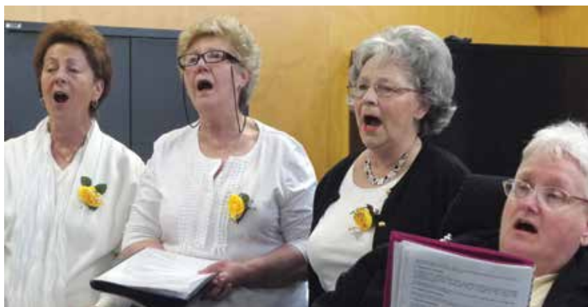
Cloverdale Singers is an acapella group that meets every Tuesday afternoon to sing a range of folk, gospel, rounds, ballads and part songs.

When: 1-3pm, Wednesdays from January 29. Cost: $2 per session.