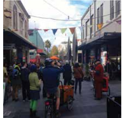
The Better Block project was trialled in central Geelong last year.