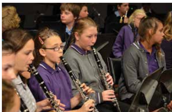
Northern Bay College hosted the biggest singing event for Music Count Us In – a day when people around Australia sing the same song on the same day at the same time.