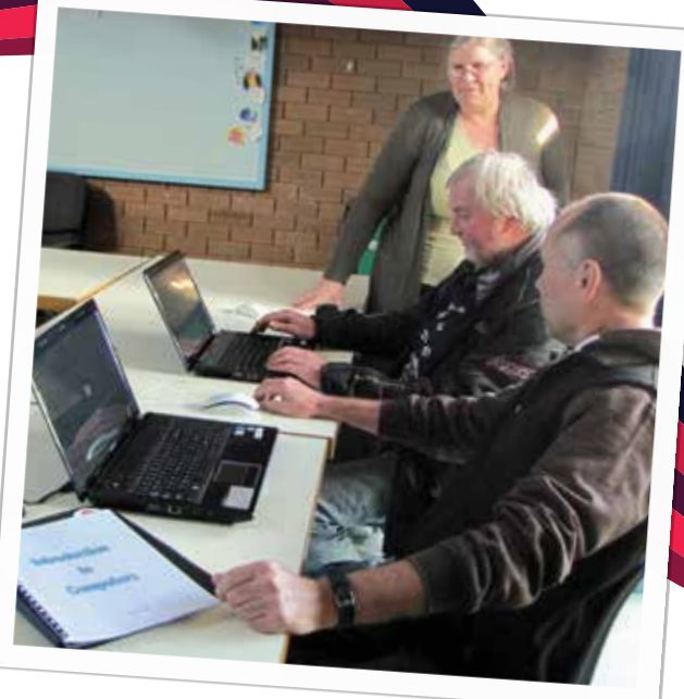
Cloverdale Community Centre will be offering Intel® Learn Easy Steps in Term 4, which is suitable for people who've never used a computer, or are unsure about the online world.