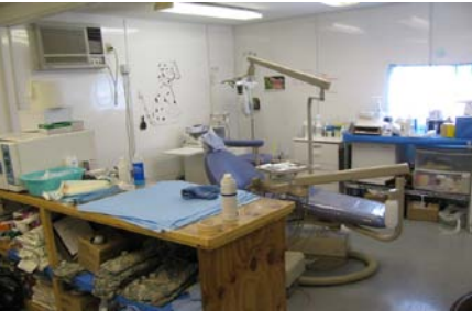
Room/function to be replaced with new dental facility.

In an ideal situation the breakdown of the design/build process was 1) receive request; 2) clarify design requirements; 3) design; 4) material acquisition; and 5) build/construct. As engineers, we all know that ideal situations are as frequent as winning lottery tickets. The following is a typical process seen in theater working on RED HORSE projects.