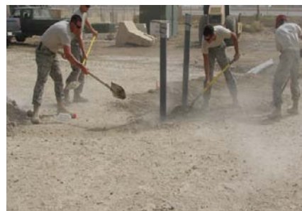
Electrician, EAs, and Heavy Operators work together to install conduit lines prior to concrete delivery for building foundation.

Finally, construction commenced with the arrival of equipment, materials and personnel. Equipment and personnel are continuously shifted/shipped to where they are most needed. Heavy equipment operators and engineering assistants usually start projects but move to other sites as needs arose. Other professions moved more often for systems and structures but an engineer was at each site to oversee the construction of all projects on the site they were assigned. These site managers would address local issues as needed or contact the project engineer for specific questions.