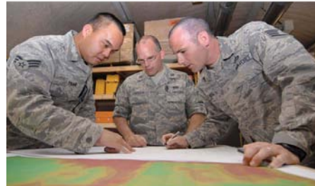
Engineer and EAs work together to resolve design issues.

Next, the Project (Lead) Engineer divided the project into areas of functional expertise between the specific engineers. Depending on the customers' needs, the engineers were sometimes able to modify an existing design, allowing construction to begin almost immediately. In the case of more complex projects, it could take as long as three months to make sure the customer is satisfied with design specifications before work begins. Civil, mechanical, and electrical engineers worked on each project simultaneously with engineering assistants and the Project Engineer consolidated component designs into a single design for review and eventual construction. The materials lists were developed along with the designs to expedite the ordering process and ensure design was accurate.