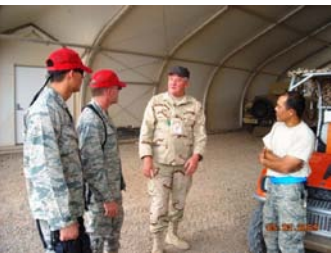
Working with customers to define project requirements.

The requests were channeled up the command prioritized for execution by RED HORSE. Once a project was received, the excitement began for the Design Cell.