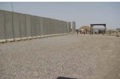
Site for new dental facility.

With a fresh project in hand, clarifying the design with the customer was a critical portion of the entire process. A project engineer was sent to the