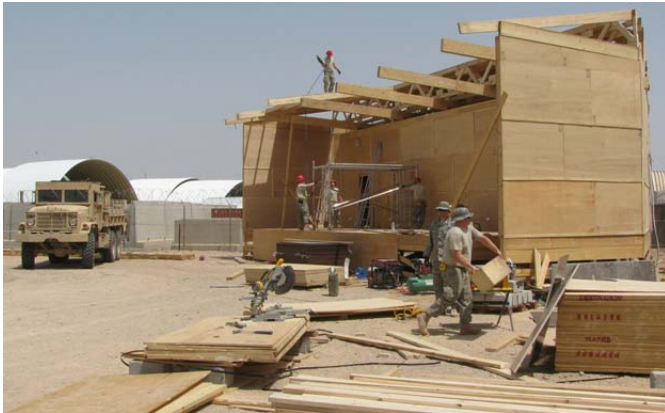
All CE career fields working together to complete a short suspense project.

In summary, projects started with a need and ended with the construction. The versatility of the RED HORSE group was demonstrated by military working together to design and construction medical facilities, airfields, storage facilities, chapel, command centers, training facilities and others totaling 149 projects within six short months. This emphasized the “expeditionary” portion of engineering at its finest.