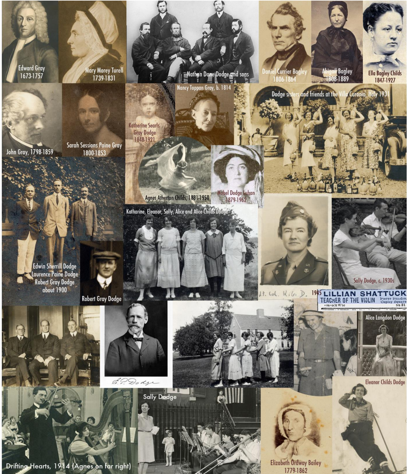
Dodge Family Photographs, Binder #4