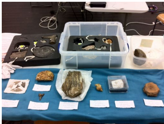
Figure 1: Geological samples and fossils.

Max/MSP, Python, Gadgeteer, Arduino, assorted sensors, contact microphones, a solid state recorder, several laptops and image projectors, amongst other, relatively transportable, items. Other items were sourced or delivered during the workshop in response to emerging design ideas.