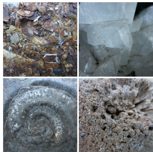
Figure 2: Textures of geological and fossil samples.

image or obtaining statistical (e.g. luminance histograms) data from it. We only have space here to outline our explorations. In addition to the wavetable scanning technique just described, we have explored an analogy of the famous ANS synthesizer's technique, whereby a scan across the image is used to create amplitude values for an large oscillator bank (we have worked with 60 or more). This creates characteristically aethereal spectral sounds which vary in relation to the form of the image. We have also explored a granular synthesis technique in which the pixel grey values in a vertical or horizontal scan map to the frequency of a sinusoidal grain. Again, this technique is sensitive to characteristics of the image in legible ways. A crystalline sample will produce a pulsing grain cloud. A particulate sample will produce a more noisy grain cloud. A smooth sample will create a gentle fluctuating tone.