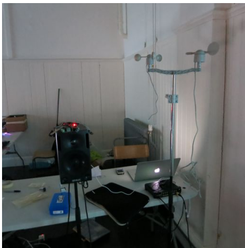
Figure 4: Gadeteer Atmospherics atop loudspeaker (left) and Weather Station (right, photographed indoors).

Using Pd/Gem, we composed very simple sonifications and visualisations of a selection of these data. For example, for the Lowestoft data, maximum and minimum temperature and sunlight data were mapped to colours (e.g. blue for the coldest, red/orange for the hottest) and oscillator frequency (lowest for coldest, highest for hottest). We played back the data archives at various rates including very fast playback which gave the sounds a granular feel and made the colours flicker. Under program control, the display randomly switched from live to historical data and made different selections of playback rate. Spending a little while with this display enabled a number of observers to spontaneously note the seasonal and historical variations in data values. For example, notably higher pitches could be heard as the data sampled enters the last twenty years.