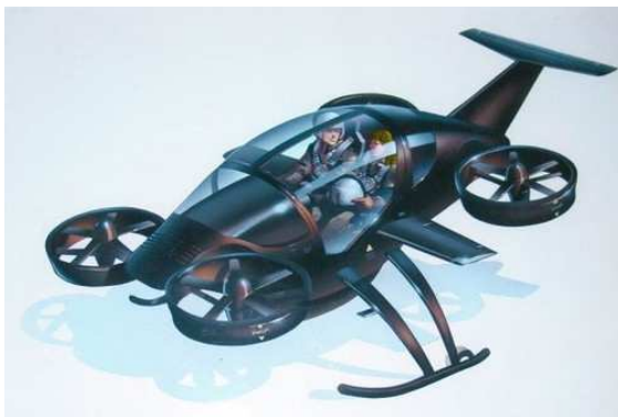
Figure 4. Perhaps something similar to this is what the Filipino witnesses saw.

The source does not describe the make or model of the vehicle only that it was a 'black' car nevertheless it is an interesting tale which has been circulating around Fortean and UFO enthusiasts for years.