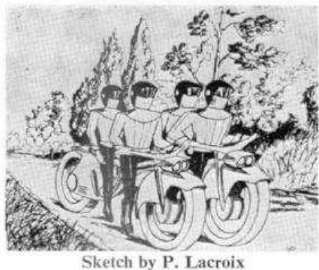
Figure 2. The Cosmic Motorcyclists at Ceret

completely silent. They were soon lost in the distance. A similar case would surface 2 years later in France: