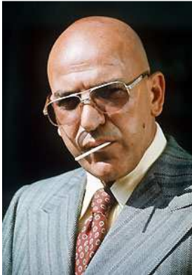
Figure 3. Telly Savalas

Telly Savalas famous encounter with the black Cadillac and Harry Agannis . The Following narrative has been compiled from various sources but the main one is John Keel "Our Haunted Planet".