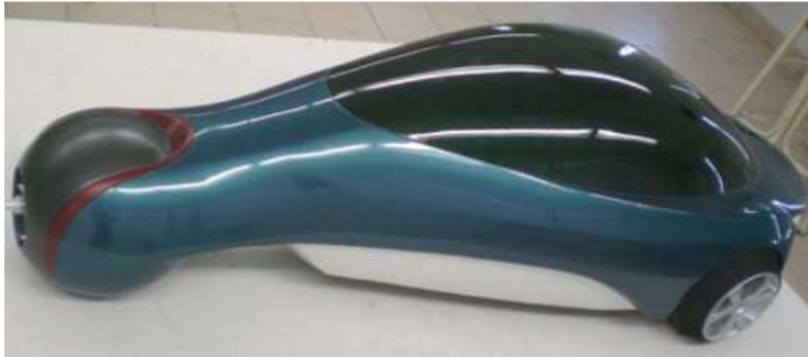
Figure 5. Cosmic car?

The next encounter comes to us from Poland and it also involves a strange car-like device without wheels and its bizarre occupants: