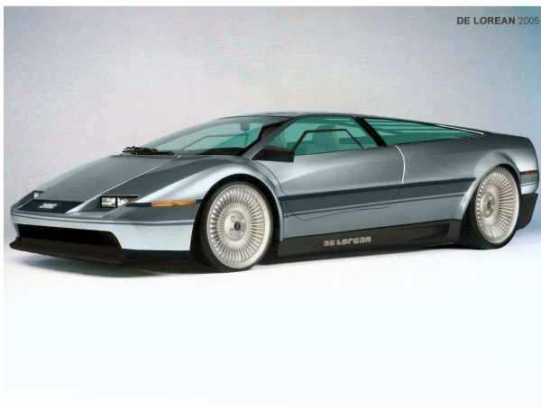
Figure 1. Futuristic looking DeLorean, would a flying vehicle look like this?

Writing for the pulp magazine "Exploring the Unknown" more specifically the August 1961 issue (Vol. 2 nr 3) on page 71 Ben Berkey writes about "flying automobiles" reportedly seen one by