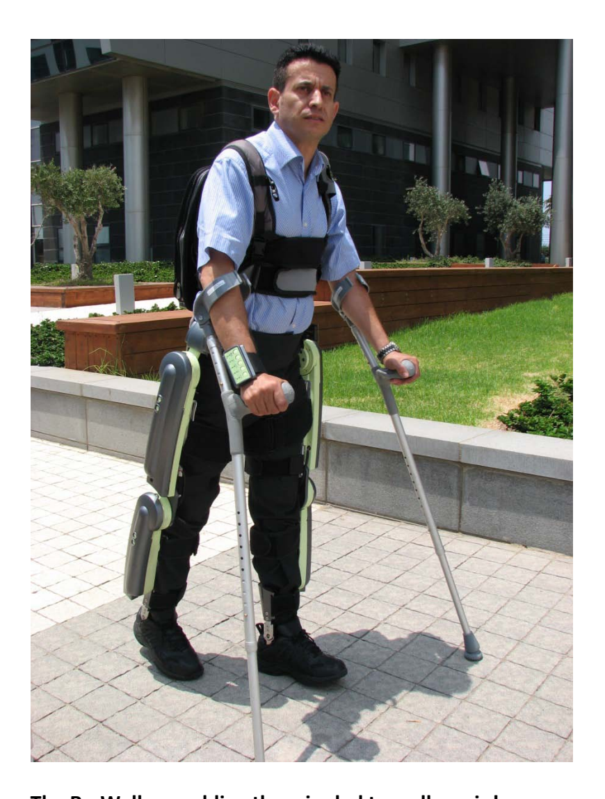
The Re-Walk—enabling the crippled to walk again!

Israel is one of the most prominent contributors to expanding use of high technology. The first cell phone was developed by Motorola in Haifa. Israel developed the first camera chip for cell phones – creating the camera phone. Israeli companies developed the SMS and Voice mail systems. The flash drive was invented in Israel in 1998 by Dov Moran (Terrorist Osama bin Laden used more than 100 flash drives to communicate with Al Qaeda cells – not knowing, of course, that they were invented by an Israeli. The firewall was invented in Israel.