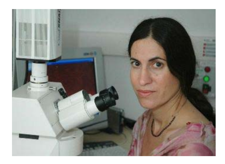
Working on the D-Cure

The world of medicine is increasingly benefiting from Israeli research and inventiveness. One of the most dramatic examples of Israeli world-wide prominence in medical research came with the selection of the country's researchers and doctors to find a cure for diabetes. The American pharmaceutical giant, Pfizer, is funding D-Cure — an intensive Israeli high-tech and biotechnological program to find a cure for diabetes. D-Cure is, furthermore, an effort to change the way doctors and scientists approach research. The program harnesses the skills of researchers from leading Israeli medical centres in a collaborative effort to find a cure fot he disease. Pfizer launched the effort with a gift of $1.5 billion.