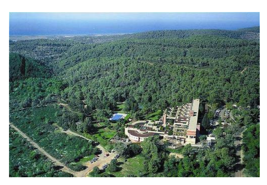
Carmel—vast forests in a restored land

Twenty-four percent of Israel's work-force hold university degrees – third in the world (after the United States and Holland). Twelve percent have earned advanced degrees!