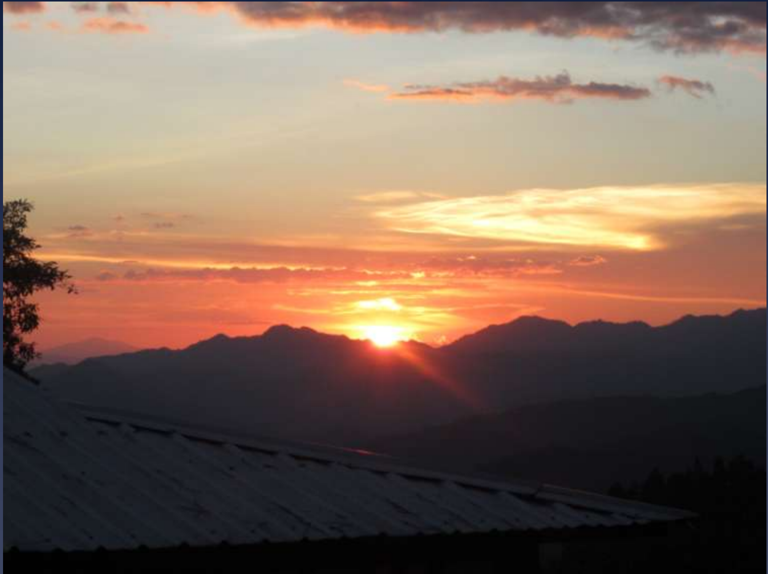
Sunset as seen from San Jose