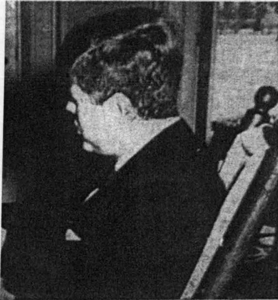
SIDENT: Indian Prime Minister Shri Jawaharlal Nehru arrived in his visit Prime Minister Nehru had been discussing world problems with addressed the United Nations General Assembly. In the course of his minister clarified India's foreign policy and its attitude towards nuclear and is scheduled to leave New York on November 17 for London and New Kennedy at the White House.