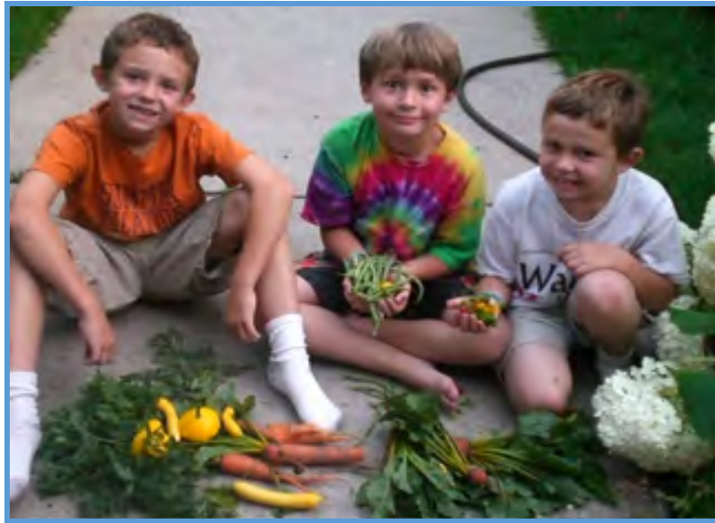
Light of Day Farm • Traverse City, MI