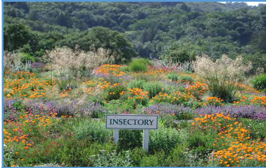
Benziger Family Winery • Sonoma, CA