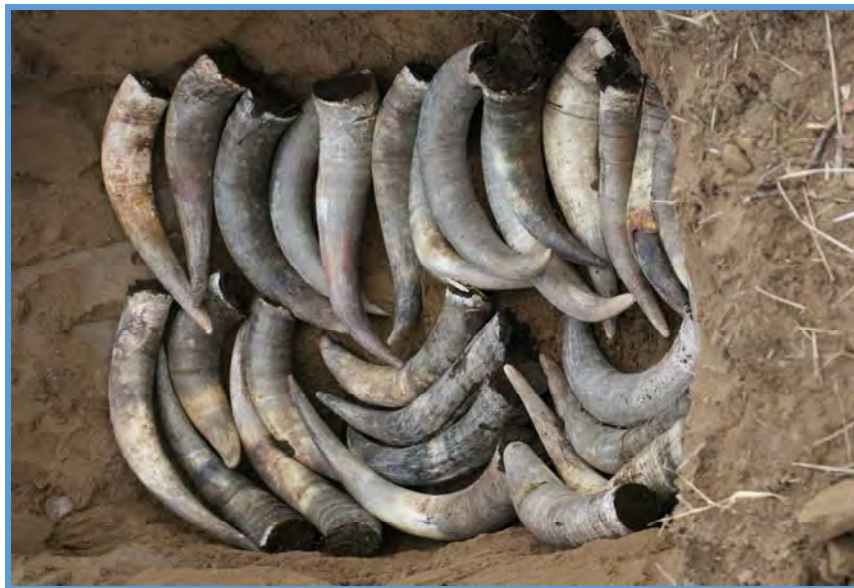
Cowhorn Vineyard & Garden • Applegate Valley, OR

The addition of some minerals, particularly trace minerals, can affect mineral balances in the soil. The importation of any minerals should be based on a documented need.