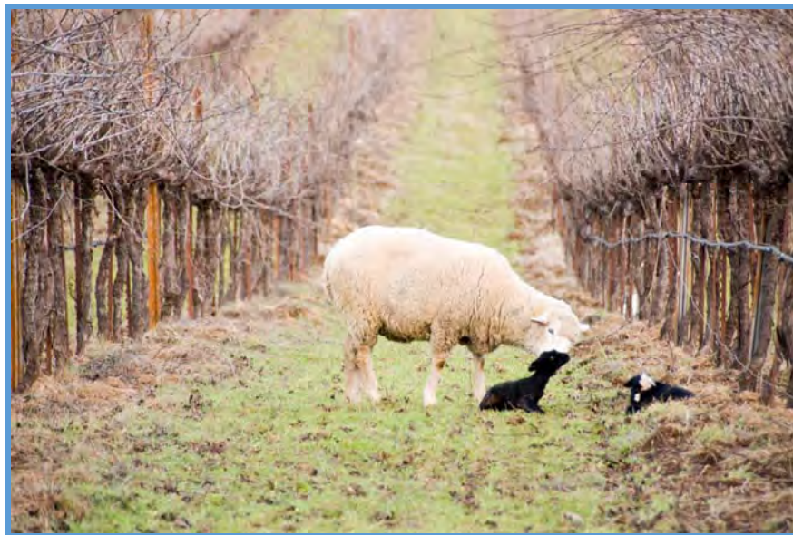
Frey Vineyards • Mendocino, CA

Agricultural production is minimally manipulated after it has been harvested. See Demeter Biodynamic Processing Standard for more information.