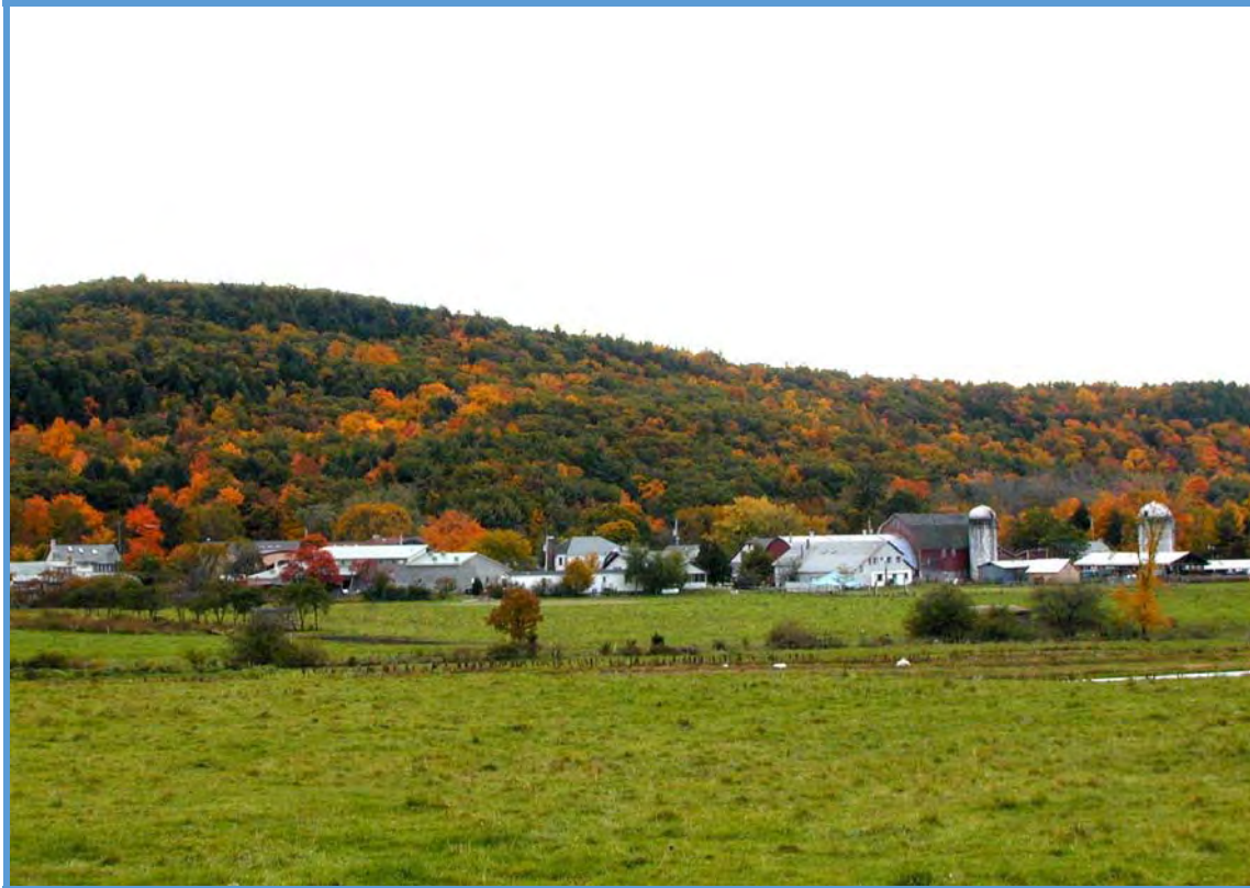
Hawthorne Valley Farm • Ghent, New York