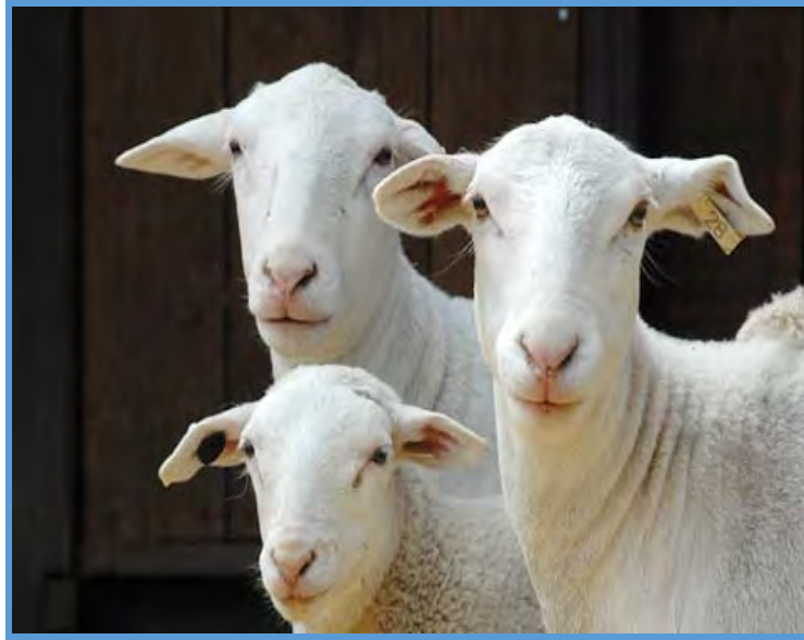
Dark Horse Ranch • Mendocino