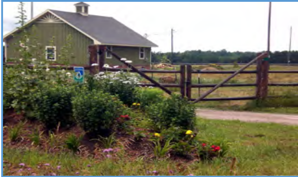
Light of Day Farm • Traverse City, MI