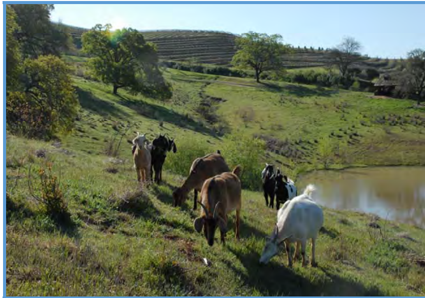
Dark Horse Ranch • Mendocino, CA