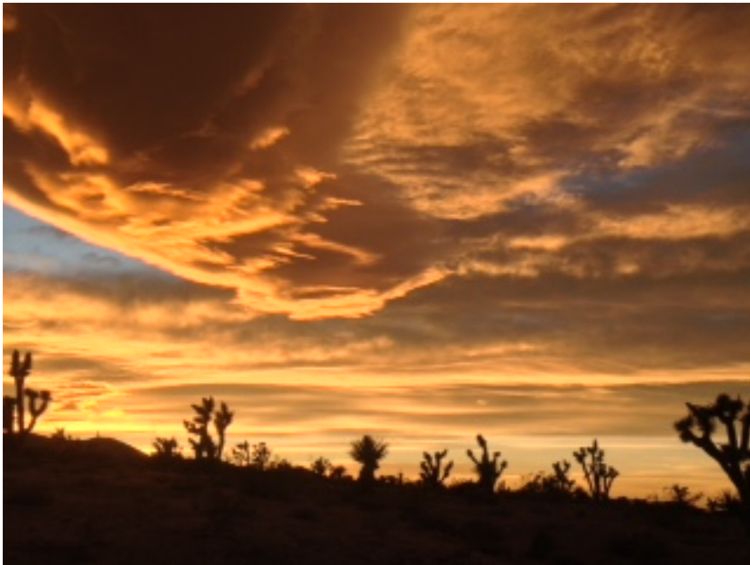
The view from my tent tonight

As I close I want to say how grateful I am for your notes of support and prayers. You are also working for peace in your own ways and I am so glad we are companions in the work of God's kingdom.