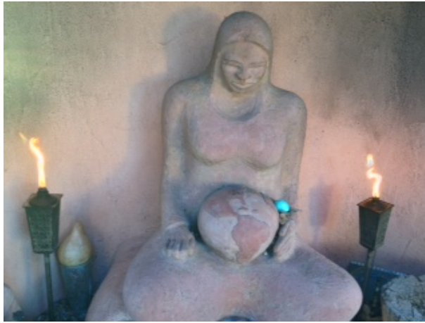
Madre Del Mundo (Mother of the World) Statue