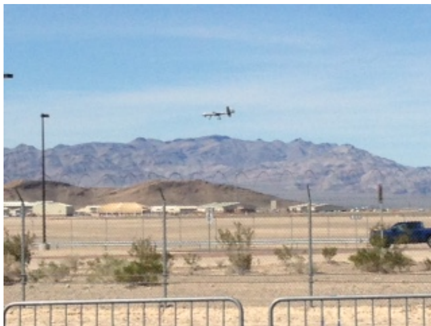
Drones flew in about every minute