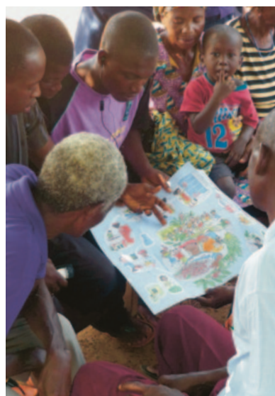
Producers in Ghana using the brochure as a training tool

Available for download at: www.fairtrade.net/brochure.0.html