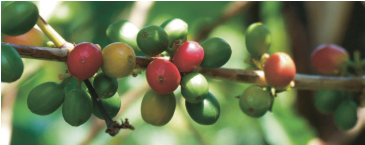
Coffee cherries at Gumutindo Coffee Co-operative in Uganda where the Fairtrade Premium has been invested in protecting natural water sources.