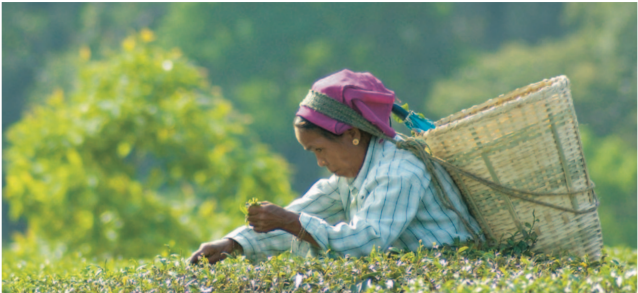
The Makaibari Tea Estate in India has invested the Fairtrade Premium in education and women's programmes.