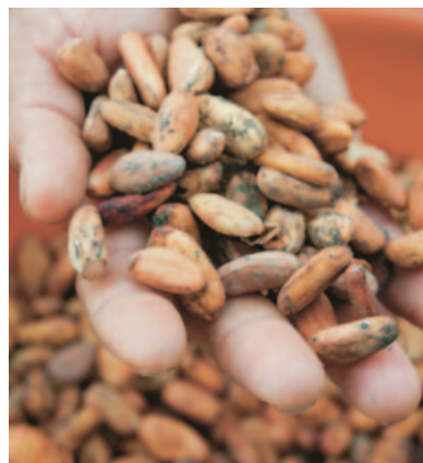
Cocoa beans from COOPROAGRO Cooperative, Dominican Republic

Fairtrade International is working closely with FLO-CERT to ensure a harmonized and effective roll-out of this improved system.