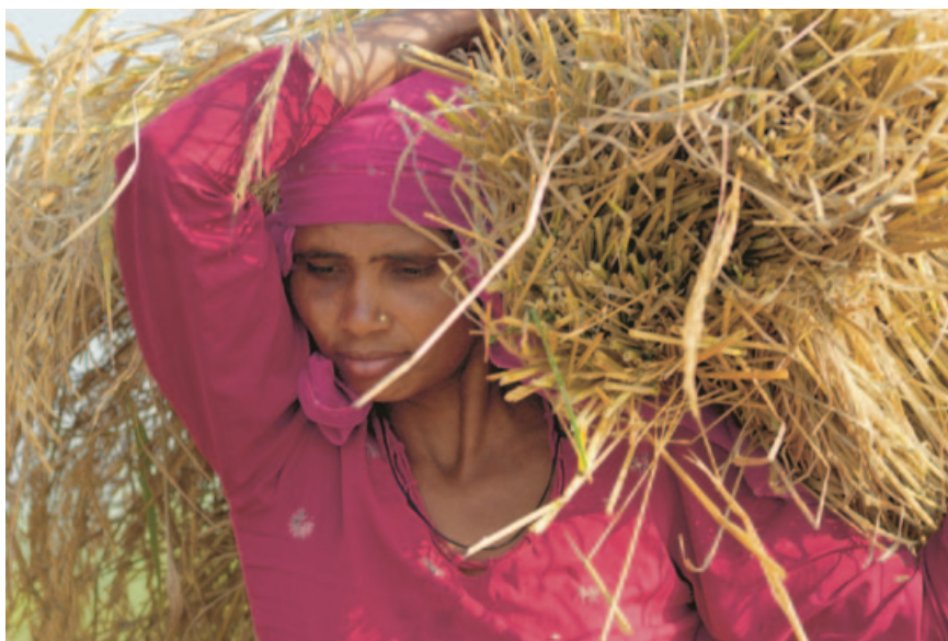
A woman harvesting rice at the Sunstar Federation of Small Farmers of Khaddar Area, India