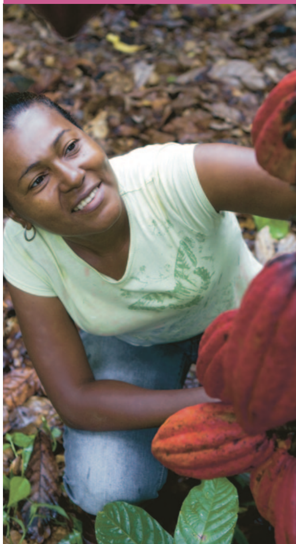
A farmer at CONACADO Cocoa Cooperative

"The great thing about Fairtrade is that it enables cocoa farmers to have a say in shaping our future through talking and working directly with retailers and companies. Our biggest worry is ensuring that we have a guaranteed market for our cocoa that provides us with long-term sustainable livelihoods."