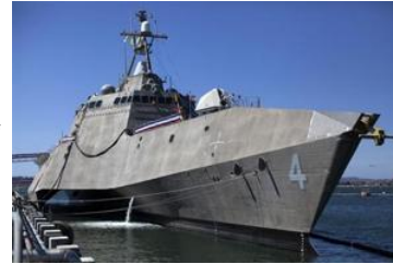
The United States littoral combat ship USS Coronado is shown during a media tour in Coronado, California ...