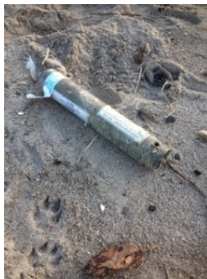
Used locator marker Stay away, call 9-1-1 or 800-452-7888