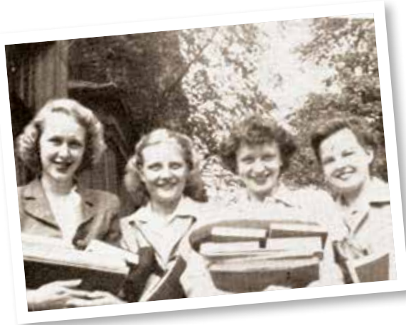
From the 1945 Carbon , the yearbook of the Boston Katharine Gibbs School, p. 16.