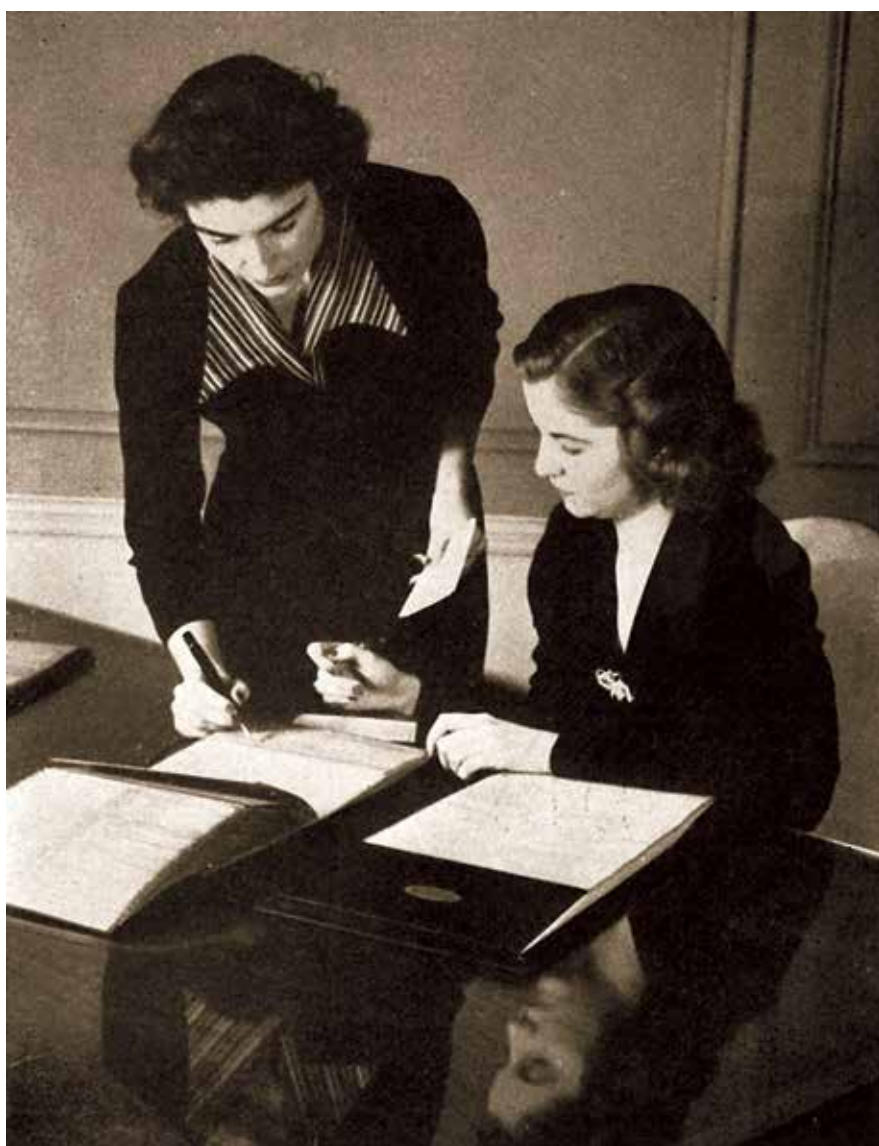
From the 1945 Carbon , the yearbook of the Boston Katharine Gibbs School, p. 48.

An NEHGS member asked me, “Wasn’t Katie Gibbs a finishing school?” when I was researching the history of the world’s most famous secretarial school. My experience and research taught me otherwise.