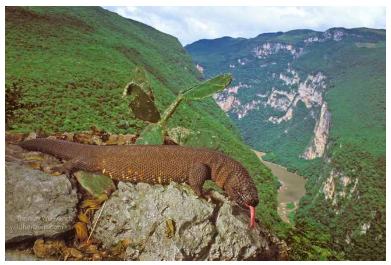
Fig. 3. Adult Chiapan beaded lizard ( Heloderma horridum alvarezi ) from Sumidero Canyon in the Río Grijalva Valley, east of Tuxtla Gutiérrez, Chiapas, Mexico. Photo by Thomas Wiewandt .