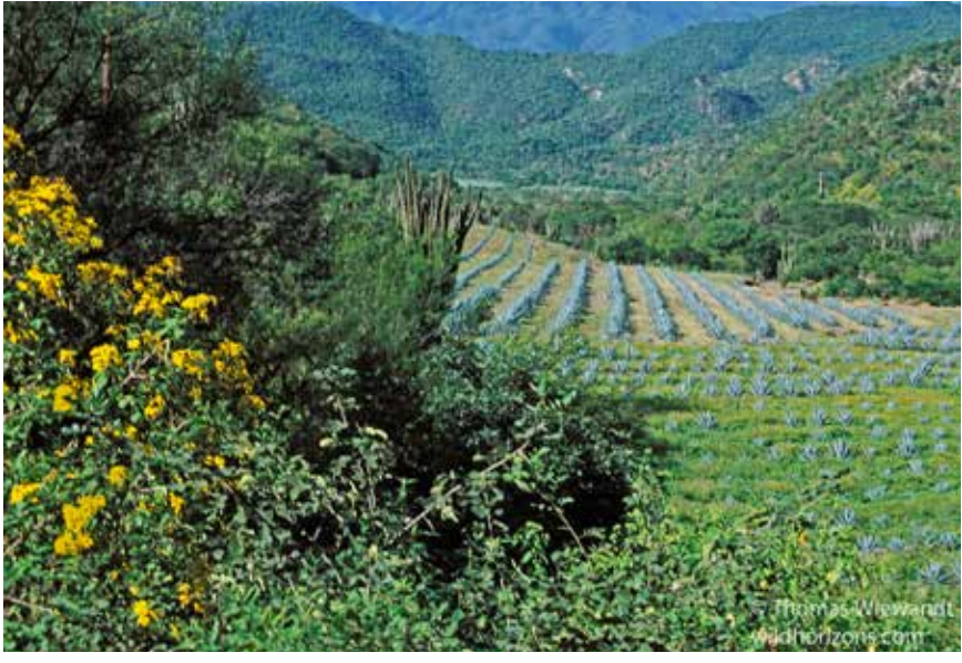
Fig. 10. Agave cultivation in Mexico results in the destruction of seasonally dry tropical forests.