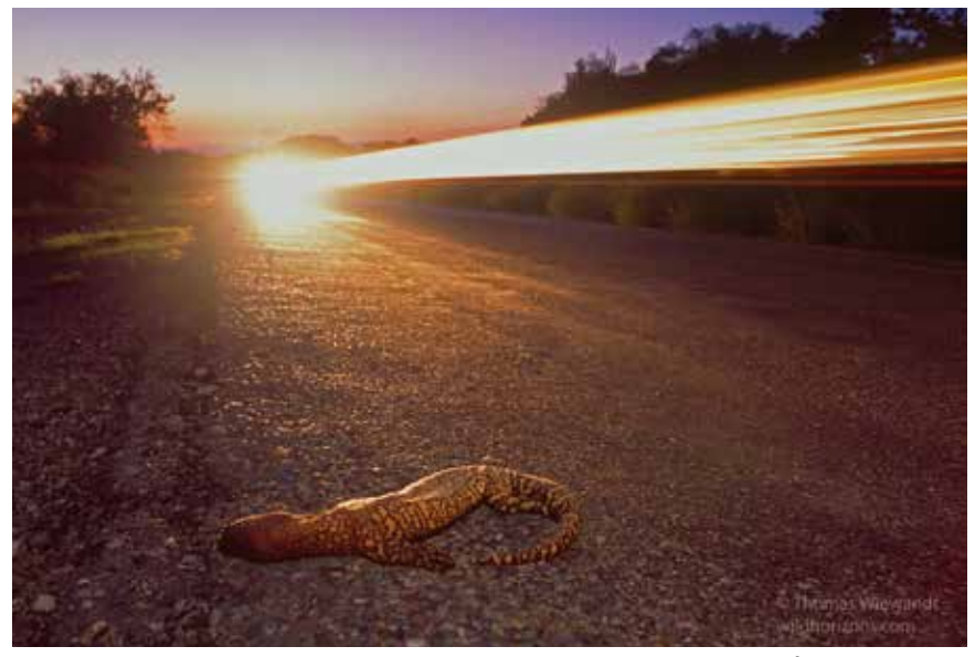
Fig. 9. A dead-on-the-road (DOR) H. exasperatum (sensu stricto) near Álamos, Sonora, Mexico. Vehicles on paved roads are an increasing threat to beaded lizards, Gila monsters, and other wildlife.

Such a conservation plan is in place for the Guatemalan beaded lizard ( H. charlesbogerti ) by CONAP-Zootropic (www.ircf.org/downloads/PCHELODERMA-2Web. pdf). Also, aspects of burgeoning human population growth must be considered, since outside of PNAs these large slow-moving lizards generally are slaughtered on sight, killed on roads by vehicles (Fig. 9), and threatened by persistent habitat destruction primarily for agriculture and cattle ranching (Fig. 10). For discussions on conservation measures in helodermatid lizards, see Sullivan et al. (2004), Beck (2005), Kwiatkowski et al. (2008), Douglas et al. (2010), Domíguez-Vega et al. (2012), and Ariano-Sánchez and Salazar (2013).