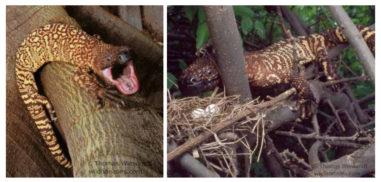
Fig. 1. A. Adult Río Fuerte beaded lizard ( Heloderma horridum exasperatum ) in a defensive display (Alamos, Sonora). B. Adult Río Fuerte beaded lizard raiding a bird nest (Alamos, Sonora).