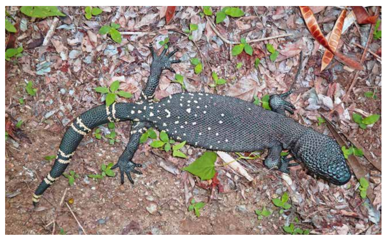
Fig. 4. Adult Guatemalan beaded lizard ( Heloderma horridum charlesbogerti ) from the Motagua Valley, Guatemala.