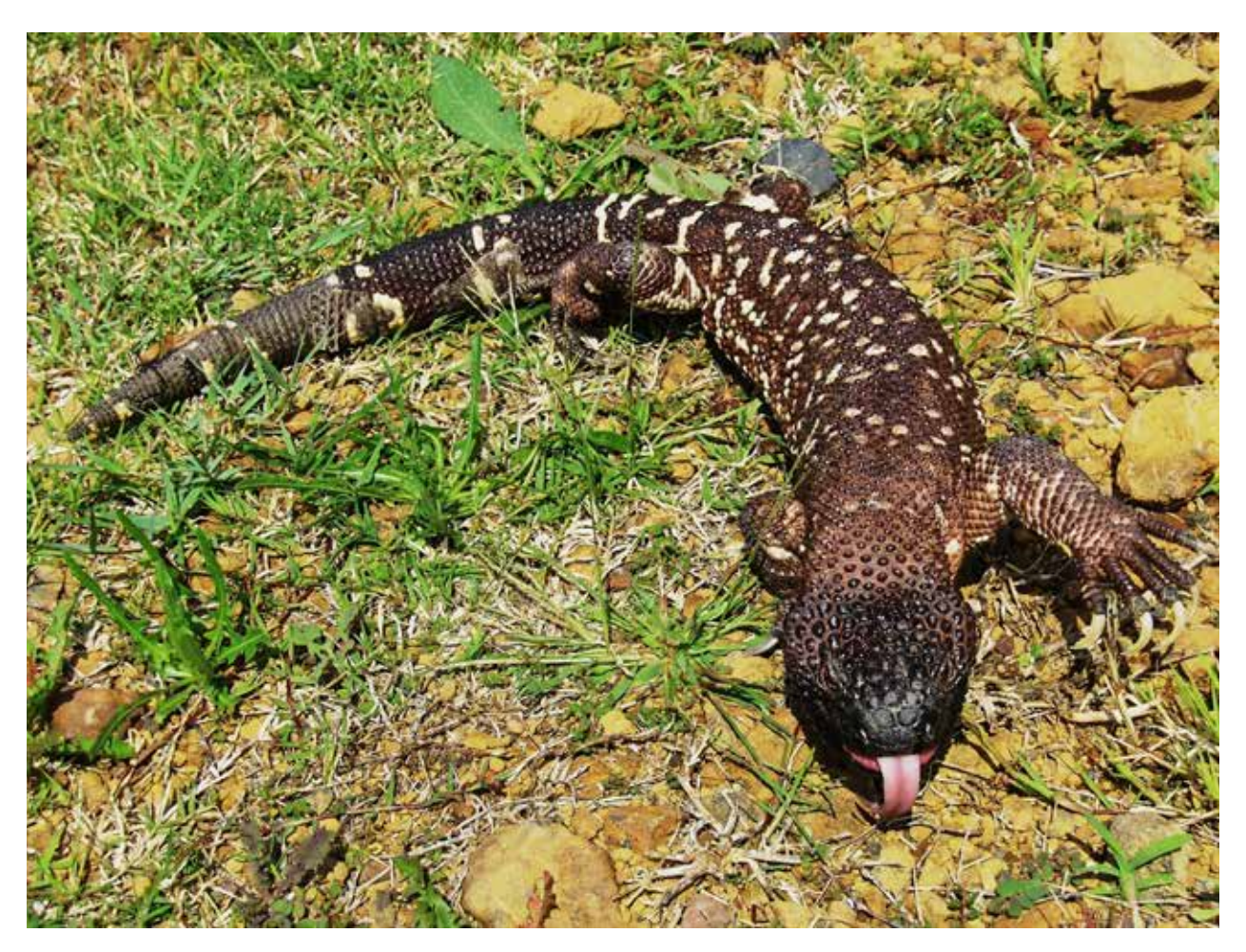
Fig. 2. Adult Mexican beaded lizard ( H. h. horridum ) observed on 11 July 2011 at Emiliano Zapata, municipality of La Huerta, coastal Jalisco, Mexico.