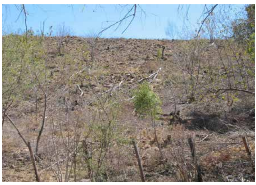
Fig. 8. Destruction of seasonally dry tropical forest near Alamos, Sonora, Mexico.

3. Conservation management plans for each of the species of beaded lizards should be developed from an integrative perspective based on modern population assessments, genetic information, and ecological (e.g., soil, precipitation, temperature) and behavioral data (e.g., social structure, mating systems, home range size).