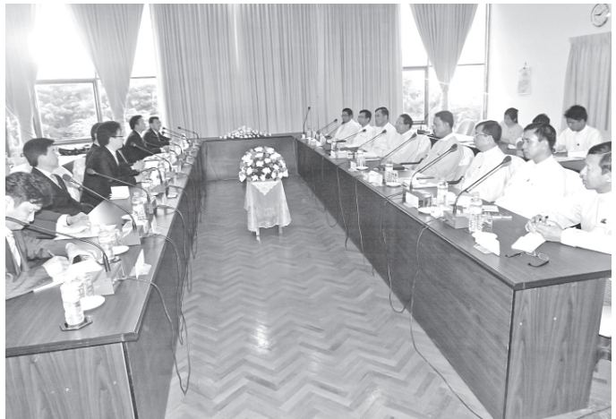
Minister for Cooperatives U Kyaw Hsan in meeting with Mr Maeng Hyung Kyu,

NAY PYI TAW, 12 Oct—In order to fulfill the requirement of capital income, the most salient point of socio-economic development of rural people, conditions of carrying out micro economic programmes, opening of new village activity plan offices, providing more assistances to arise model villages, establishing rural libraries, sending trainees and skilled persons to villages to provide vocational trainings, providing technical know-how for those trainings and signing MoU between the two countries to implement such kinds of works were discussed by Union