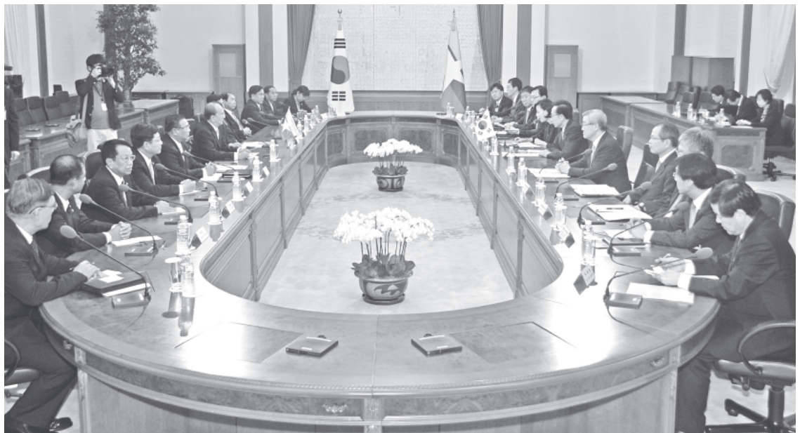
President U Thein Sein holds discussion with President of the Republic of Korea Mr Lee Myung-bak.