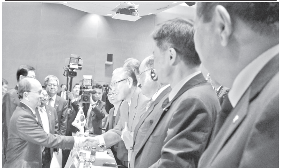
President U Thein Sein cordially greets those present at Myanmar Investment Forum.—MNA