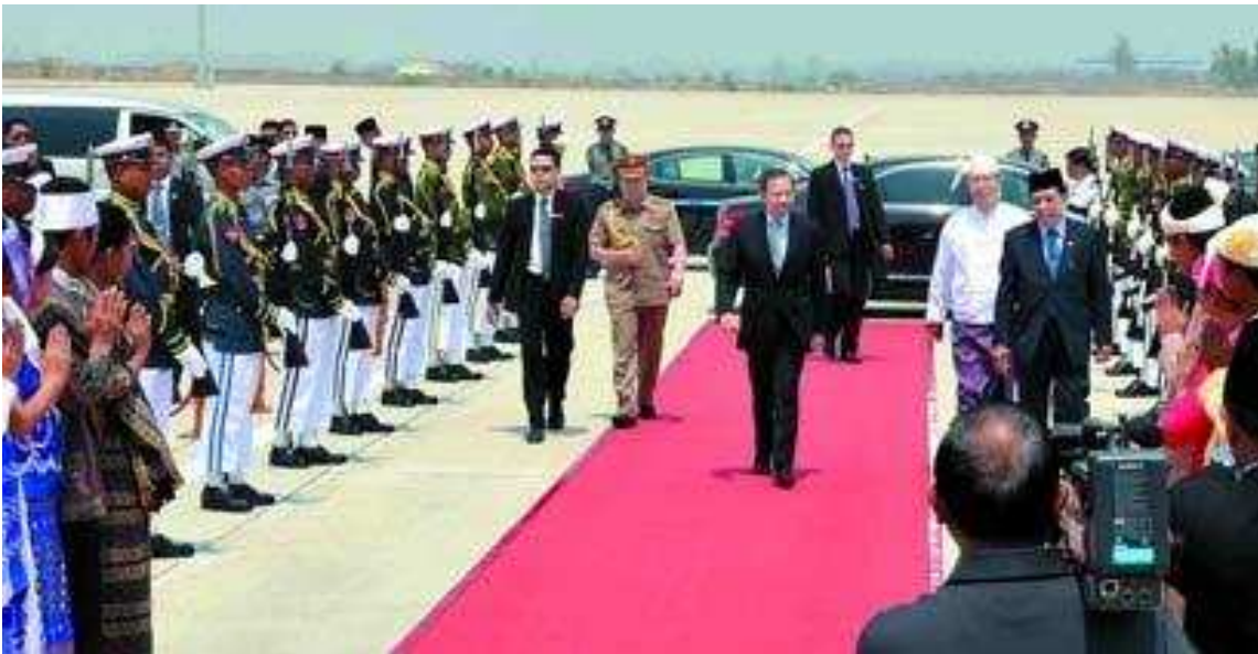
Brunei Sultan Haji Hassanal Bolkiah Mu'izzaddin Waddaulah being seen off at Nay Pyi Taw International Airport by officials.