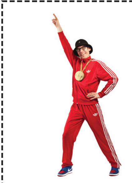
Step 1: Point up high.