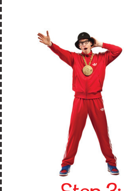
Step 3: Do the sprinkler.